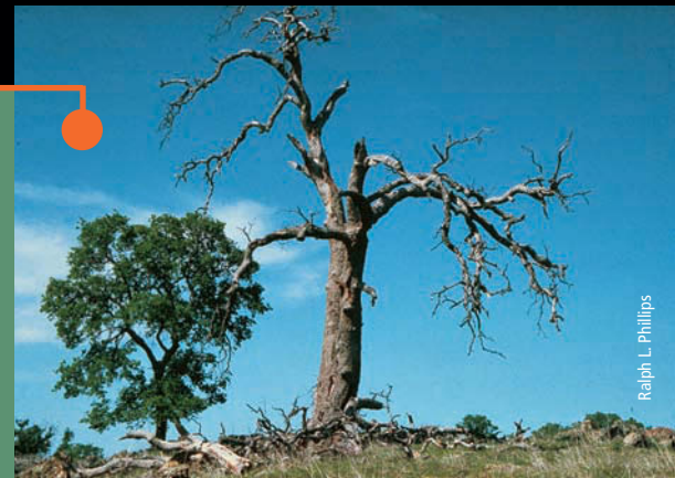
Ralph L. Phillips

Blue oak trees are a valuable economic and aesthetic resource in California oak woodlands, which provide some of the richest wildlife habitat in the state. However, their current regeneration rates may not be adequate to replace mortality, due to a variety of factors. In some regions, the regeneration of blue oak is limited by the ability of seedlings to survive long enough to become larger saplings. Two related, long-term studies by UC researchers examine the growth of blue oak seedlings and the effect of exclosures — which protect seedlings from livestock and wild-animal grazing — on their survival.