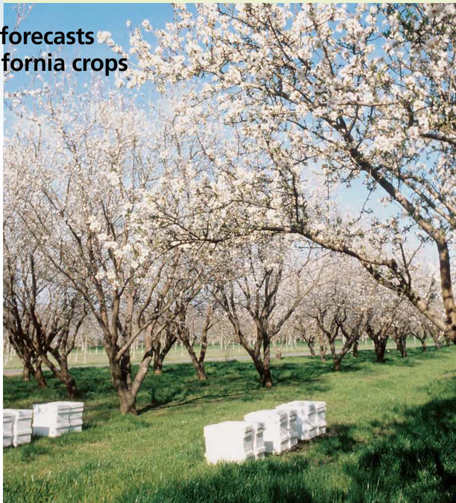
Weather-based yield predictions were developed for 12 major California crops, based on more than 20 years of daily weather records and actual yield data. The highest correlation between weather and yield was seen in almonds.

Forecasts of crop yields can provide important information about commodity markets and are frequently used by growers, industry and government to make decisions (Vogel and Bange 1999). For instance, growers may use forecasts to plan their harvest, storage and distribution strategies: California growers used the 2004 forecast of a large rice harvest to