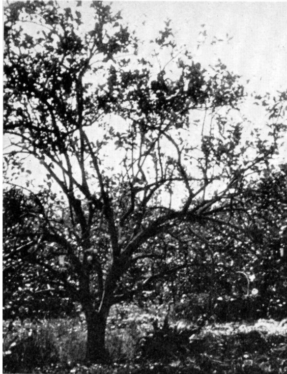
Lemon tree in the Escondido area defoliated by California red scale. The injury occurred when natural enemies were virtually eliminated for an eleven-month period by light monthly sprays of DDT, designed to be ineffective against scale.