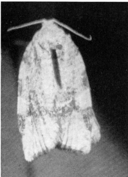
Fruit tree leaf roller, adult moth.

For application with a speed-type sprayer using 500 gallons of water per acre, or with a spray-duster or boom