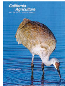
May-June 1999 issue