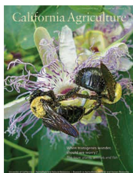
July-September 2006 issue

The CS staffers received their awards at the ACE annual conference in Albuquerque, N.M., on June 18.