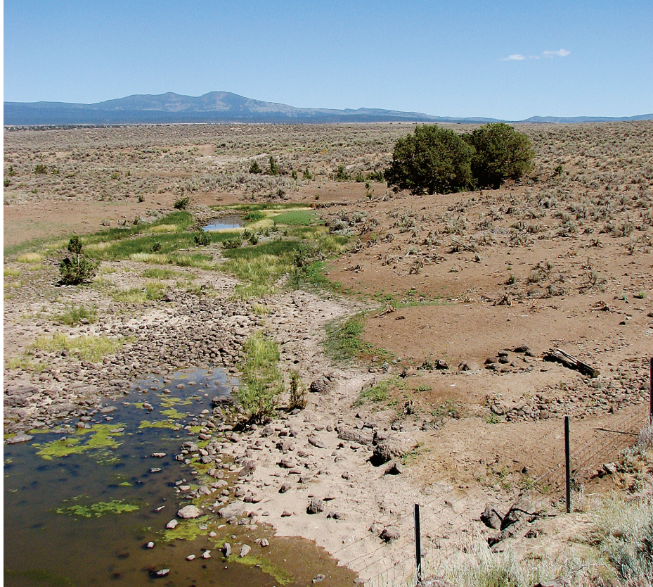
This review and analysis found that even the complete removal of juniper is not likely to significantly increase water yields in the California portion of the Klamath River Basin. Above, the Big Juniper drainage, between Alturas and Likely.

How much removal? The literature on how much juniper removal is required to increase water yields is limited. Bosch and Hewlett (1982) proposed that the amount of vegetative cover removed is proportional to changes in water yield and that, for many areas, removing less than 20% of the cover would not yield detectable changes in stream flows. In contrast, Hibbert (1983) reported that the relationship between percentage of vegetation removed and reduced transpiration is nonlinear, and that meaningful reductions in transpiration in arid environments are only achieved at high levels of removal. For instance, removing half of the deep-rooted vegetation may hypothetically result in only a 20% reduction in transpiration.