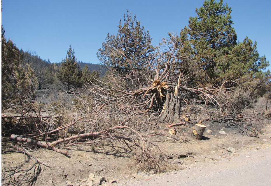
Numerous juniper removal projects have been implemented in the Klamath River Basin, including by cutting and prescribed burning.

However, this method of increasing water yield to arid watersheds in the eastern Klamath River Basin must be applied cautiously. Examining studies in arid and semiarid lands, Hibbert (1983) concluded that less than 1% of rangelands in the western United States are conducive to being successfully managed for increased water yield by vegetation conversion.