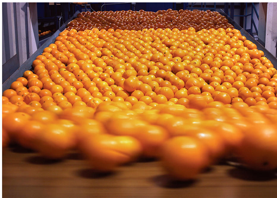
A 12-year economic comparison of cooperatives and investor-owned firms on the West Coast found that fruit and vegetable cooperatives had higher operating margins but also more annual volatility. Above, oranges at the Sunkist Growers cooperative, which was formed 114 years ago to market California and Arizona citrus.

Profitability: Ability of a firm to generate net income.