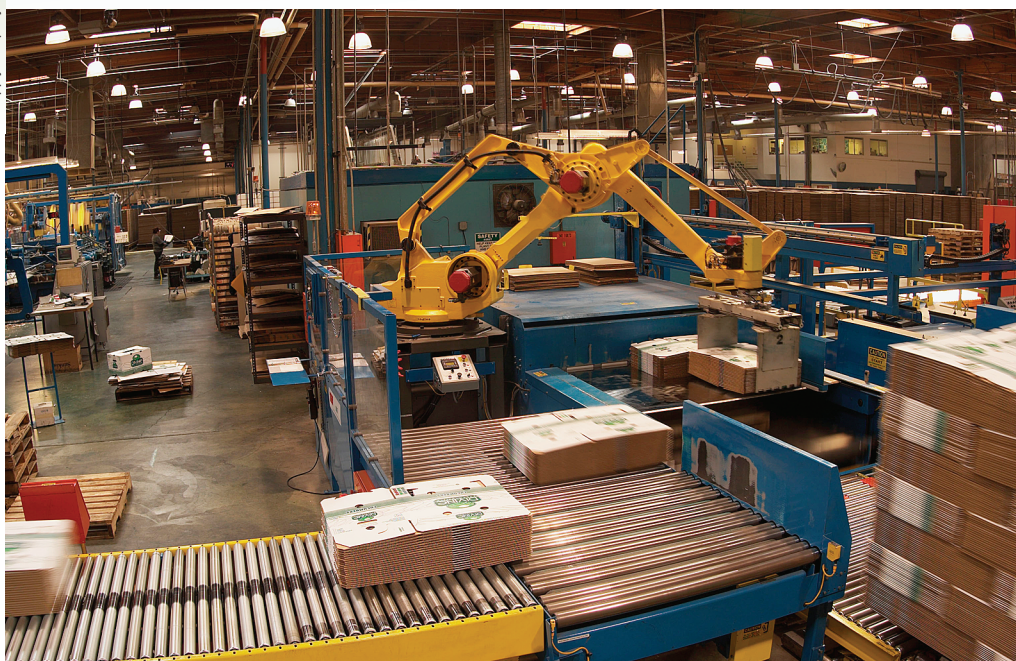
Agricultural cooperatives were created to benefit member farmers, rather than investors. Above, Fruit Growers Supply Company is a 100-year-old cooperative that supplies citrus packinghouses with cartons from its plants in Ontario and Visalia, Calif.

Cooperatives are corporations that are owned and governed by the firms or people who use them; they differ from other businesses because they operate for the benefit of their members, rather than to earn profit for investors. Cooperatives have played an important historical role in promoting the economic welfare of California's agricultural producers. Recently, however, reports regarding the financial difficulties experienced by U.S. agricultural cooperatives have been much more common than news of their successes. In particular, the 2002 bankruptcy of Farmland Industries — a federation of 1,700 independent Midwestern cooperatives and the nation's largest agricultural cooperative — received considerable media attention. In California, news about cooperatives has centered on the bankruptcy of Tri Valley Growers in 2000; the dissolutions of Blue Anchor and the Rice Growers Association of California in 2000; and the conversions of Calavo in 2001 and Diamond Walnut Growers in 2005, to publicly traded, investor-owned corporations.