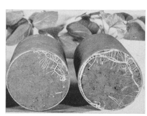
Root development of beans in undisturbed soil samples from a field having a soil density of 1.60. The roots grow between container and the dense soil. They are flattened and four to five times as wide as they are thick. All branching of the roots is parallel to the surface of the dense soil on the sides and the bottom of container.

Samples three and four were taken from the same field in an unplanted area where farm equipment was turned repeatedly in cultivating the field. The soil was of high density and low infiltration rate to a depth of at least 14", apparently