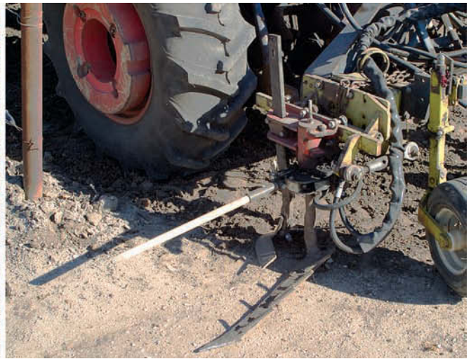
There were no differences in vine growth, crop yields or fruit composition among all the weed control treatments in the 5-year study, demonstrating that vineyard floors can be managed effectively without high-risk herbicides. For the cultivation treatment, above , the Radius Weeder inserts a knife into the soil to sever weed shoots from their roots.

cumulative cash costs, ranging from $899 to $1,032 per acre over the 4-year study period (fig. 2B). The pre-emergence treatment had the next highest cumulative cash costs, ranging from $555 to $690 per acre. The post-emergence treatment was least expensive, at $498 to $633 per acre.