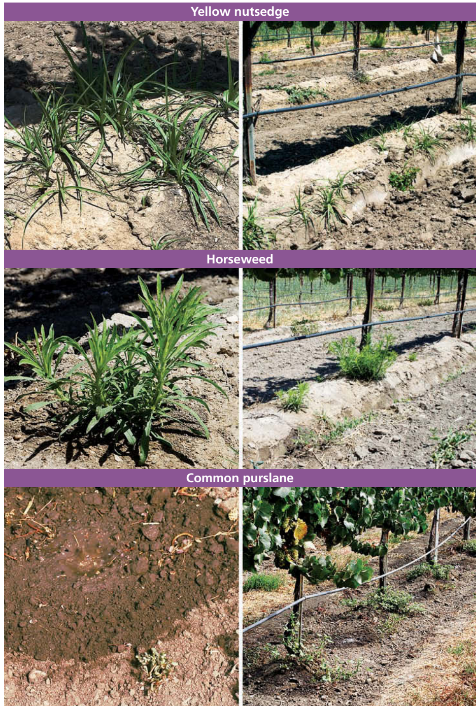
To assess the effectiveness of various vineyard floor management strategies, the authors compared pre- and post-emergence herbicide treatments with cultivation in the rows, and several different cover crops in the middle. The primary weeds in the Monterey County vineyard were yellow nutsedge, horseweed and common purslane.

* Values within a column followed by the same letter are not different (Fisher's protected LSD test, \alpha = 0.05 ).