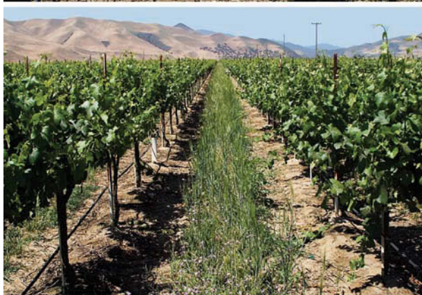
Vineyard floors are managed to prevent competition from vegetation that can inhibit grape yields and quality. Top , cultivated bare ground in the row middle; bottom , a cover crop.

Growers along California's Central Coast are under increasing pressure to keep herbicides from contaminating groundwater, and in turn, the Monterey Bay and National Marine Sanctuary. In vineyards, weed control generally consists of both pre- and post-emergence herbicide applications. The common pre-emergence herbicide simazine has been identified as a contamination risk for groundwater. This project was initiated to compare the long-term effects of floor management practices and alternative weed-control strategies on vineyard productivity over five growing seasons (2001 to 2005). In addition, we evaluated the associated economics over four growing seasons (2002 to 2005).