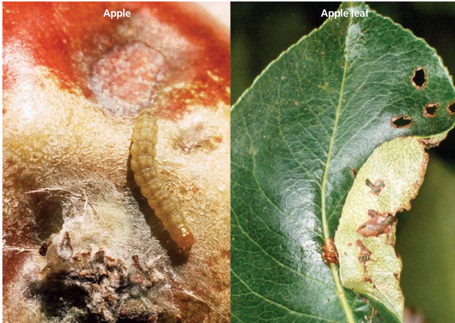
Originally from southern Australia, the light brown apple moth can feed on and damage a broad range of crops such as, above, apple. If the pest becomes established in California the most important impact to growers will likely be trade restrictions on crop exports.

webbed together, a leaf webbed to a fruit, or in the center of a fruit cluster. The larvae feed within these shelters, and they may feed on fruit when it touches a leaf. Larvae on fruit are most likely to be found near the calyx, the residual basal flower parts. When disturbed they wiggle violently, suspend themselves from a silken thread and drop to the ground, where they feed on groundcover hosts. Larval development can take from 3 to 8 weeks, depending on temperature. Pupation is completed inside the silken feeding shelter. The pupal stage lasts 1 to 3 weeks.