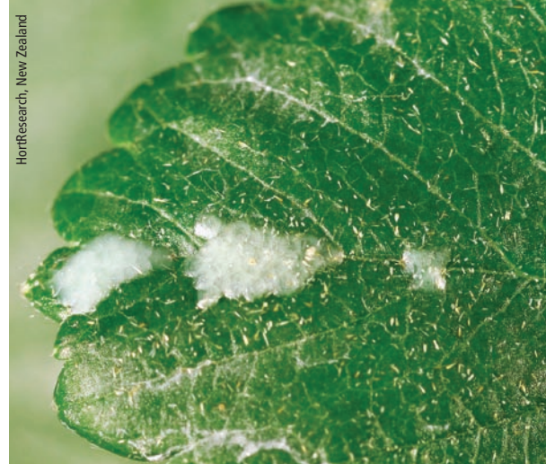
Eggs of the light brown apple moth are typically deposited on the upper surface of host leaves in masses of 20 to 50.

year in the Central Valley and Southern California. The lower and upper developmental thresholds for light brown apple moth are 45°F and 88°F, respectively (Danthanarayana 1975). Completion of the entire life cycle requires 620 degree-days above 45°F. In Australia, New Zealand and the British Isles, generations overlap. Light brown apple moth does not have a winter resting stage (diapause). Cold winter temperatures