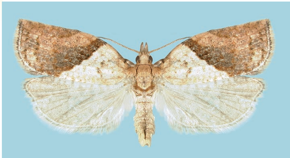
The light brown apple moth, a tortricid leafroller, is extremely variable and difficult to identify visually. The insect's reproductive organs must be examined in order to obtain a positive identification.

Although light brown apple moth has been confirmed in 14 counties, only por-