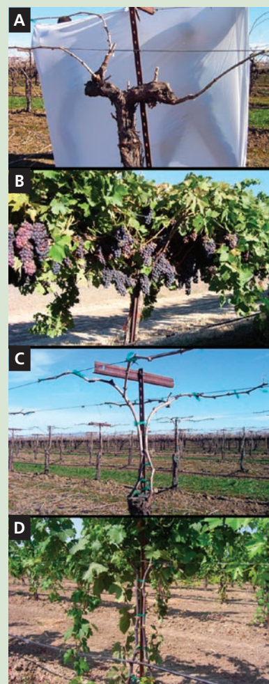
In 'Zinfandel' vines mildly infected with Botryosphaeria obtusa , (A) infected cordon wood was removed, and cane pruning replaced spur pruning and (B) regrowth was treated by removing the cordon portion with dead spurs; in severely infected vines, (C) almost all of the scion was removed and new canes were trained and (D) most of the cordon was removed.

Severe Botryosphaeria infections may require a different approach. We have successfully left the infected cordons in place and utilized cane pruning with the remaining healthy and productive wood. However, when the per-acre yield per block falls below an economically viable level, severe vine surgery (as opposed to vineyard replanting) will allow vines to stay in the ground and most of the trellis and drip irrigation system to remain intact. The cost for cutting vines above the graft union and about 12 inches from the ground (see photo C), removing and disposing of the upper portion of the vine and the cordon wire, painting the wound, reinstalling a new cordon wire, retraining and tying the vine, repairing trellises and conducting standard farming activities was about $4.20 per vine or about $2,200 per acre. This method should yield almost a full crop in the second year (see photo D). We are currently evaluating several training practices with the use of either two trunks to reestablish bilateral cordons or quadrilateral cordons, or training the vine for cane pruning (see photo D).