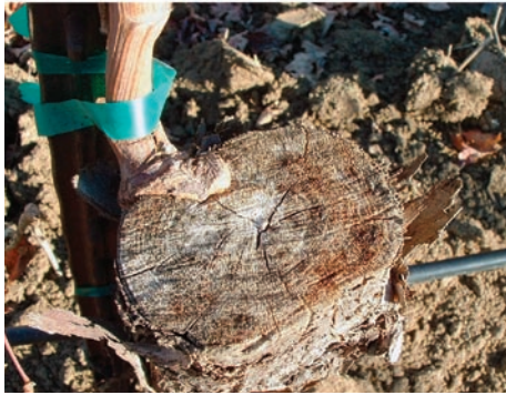
Top, Duration paint is being tested as a treatment for surgical cuts on grapevine trunks; lower, an untreated vine.

B. obtusa in 28% of asymptomatic shoots and 90% of symptomatic 1-year-old shoots (n = 54) 3 inches from the cordon. Symptomatic shoots that were surface-disinfected and incubated in a humid chamber at 74°F for 3 weeks produced B. obtusa pycnidia. Overall, our data are consistent with a life cycle in which B. obtusa grows asymptotically within grapevine shoots and woody tissue. We postulate that damage to the vine occurs primarily by the grapevine's release of self-defense compounds that kill its own cambium.