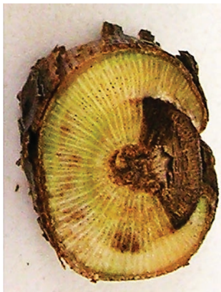
In a pathogenicity test, Botryosphaeria obtusa caused a wedge-shaped lesion.

face. After conidia are released during rainy weather and disseminated via wind-blown rain, the empty pycnidial cavities remain on the plant surface. B. obtusa pycnidia were never observed on grape berries, and no sexual spores of either Botryosphaeria spp. or E. lata were ever observed.