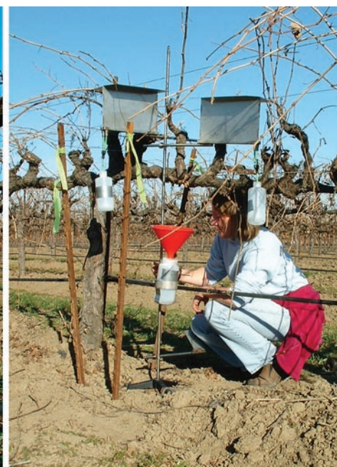
Stands were used to collect fungal spores disseminated in rainstorms. Left , each stand had a funnel under the cordon for estimating available inoculum within the vine, and a plate on the ground (2.5 inches high by 20 inches wide) at a 45° angle to collect splash from debris; right , stands also had two tented plates (8 inches high by 12 inches wide), which were designed to collect wind-blown rain.

to black streaks in a longitudinal section. B. obtusa isolates are pathogenic, and B. obtusa grows more quickly in woody tissue than E. lata (table 1). Our results are in agreement with other reports in which B. obtusa and other Botryosphaeria spp. are identified as important grapevine pathogens (Leavitt and Munneke 1987; Phillips 1998, 2002; Savocchia et al. 2007; van Niekerk et al. 2004, 2006).