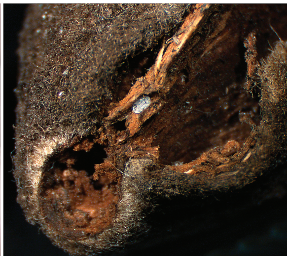
Navel orangeworm control can be achieved in almonds by careful orchard sanitation, early harvest of the 'Nonpareil' variety and postharvest fumigation with insecticides. Clockwise from top left: a navel orangeworm adult; a fertile navel orangeworm egg laid on a mummy almond; a hatched egg; and an almond mummy infested with navel orangeworm larvae.

damage goal for navel orangeworm has been 2% or less. Factors contributing to this current threshold include the crop's increased value and the association of kernel damage by navel orangeworm with aflatoxin contamination, a major quality concern (Schatzki and Ong 2001; ABC 2006). In addition, the European Union — the largest market for California almonds — has imposed more-stringent import standards that have lowered the allowable level of aflatoxin B1 to 2 parts per billion (OJEU 2007).