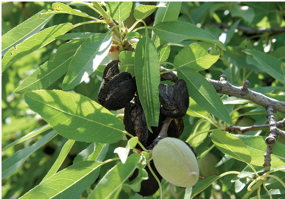
Sanitation practices in almond orchards can have a significant impact on insect pest damage. Almond "mummies" remaining on the tree after harvest provide overwintering sites for navel orangeworm, which then infests the new crop.

Almond and pistachio plantings comprise more than 880,000 acres in the Central Valley (NASS 2006). Almonds account for about 83% and pistachios for about 17% of these plantings (730,000 and 153,000 acres, respectively). 'Nonpareil' is the most popular almond variety, comprising 37.7% of all standing acreage in 2006, and 'Kerman' com-