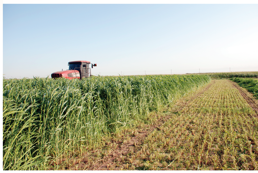
Sudex is a hybrid of sorghum and sudangrass that is grown extensively as a cover crop in the Imperial and San Joaquin valleys to reduce erosion, improve soil structure and suppress weeds. It appears to have allelopathic properties that can damage subsequent vegetable transplants. Above , sudex silage is harvested in Turlock.

Sudex, a sorghum-sudangrass hybrid, is grown as a cover crop in California to reduce erosion, improve soil structure and suppress weeds. Additionally, sudex ( Sorghum bicolor [L.] Moench × S. sudanense [P.] Staph.) serves as a source of green manure (Weston et al. 1989), forage and silage (Chaudhry et al. 1997). Sorghumsudangrass hybrids, including sudex and collectively known as sudan, are cultivated extensively in the Imperial and San Joaquin valleys. In Imperial County, over 55,000 acres of sudan hay is produced, while in the San Joaquin