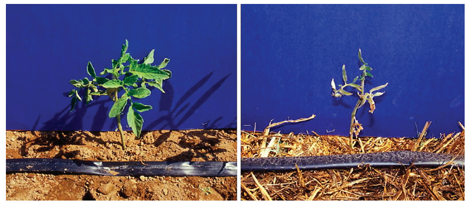
Tomatoes planted too soon after a sudex cover crop can suffer from mortality or yield reductions. Left , a healthy control tomato was planted in fallow soil. Right , a tomato transplant set 20 days after sudex roots and shoots were cut is stunted and shows evidence of necrosis (dead tissue) on the leaf margins.

killed sudex crop during the summer. We also examined the impact of sudex on broccoli ( Brassica oleracea var. botry tis L. 'Marathon') and lettuce ( Lactuca sativa L. 'Cowboy') crops that would likely be transplanted in the fall following a summer sudex crop.