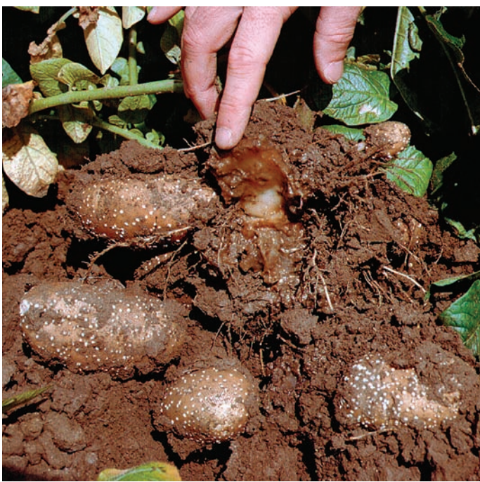
Seed-piece decay is associated with Erwinia leaf and stem symptoms; note the open lenticels on the potato tubers.

mechanical injuries. Cut seed should be allowed to heal to provide a barrier against bacteria. Management of water and soil fertility throughout the growing season is critical to reduce the incidence of disease. Tubers should be harvested when the skins are set and the lenticels are closed, since breaks in the skins and open lenticels are good avenues for infection. Since soft-rot Erwinias can be drawn into tubers through open lenticels as the warm tubers are washed in cool water during the dump wash process, tubers should not be exposed to hydrostatic pressure from either deep tanks or tall rises in flumes (pipes for moving tubers from the wash tank) in the packing sheds. Care should be taken to avoid scuffing, cutting or bruising potatoes during sorting and packaging. Finally, potatoes should be stored dry and cool.