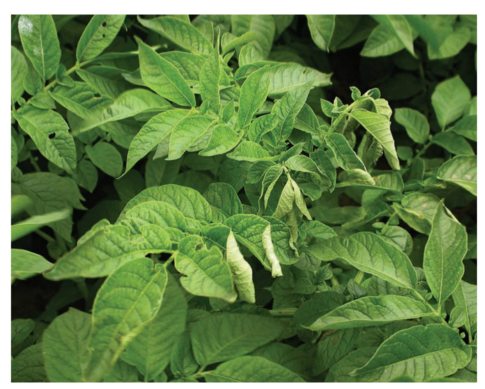
The initial symptoms of Erwinia early dying — a potato plant disease associated with lenticel rot — include leaf wilt in adequately irrigated fields.

Lenticel rot. We isolated Erwinia carotovora subsp. carotovora (more recently called Pectobacterium carotovorum subsp.