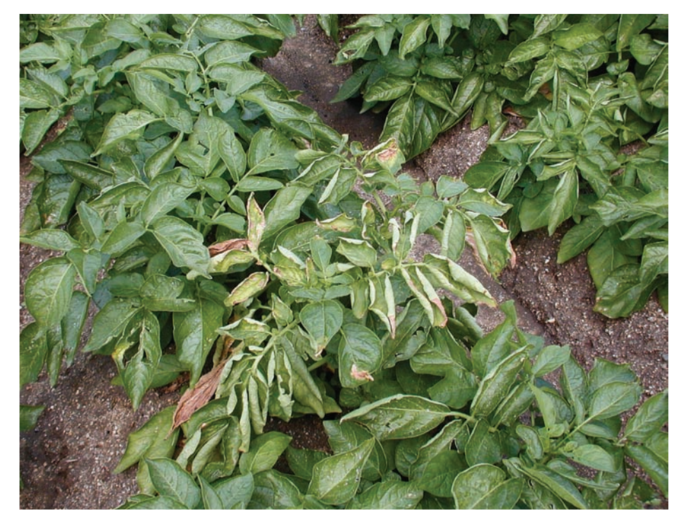
As Erwinia early dying progresses, leaves wilt further and die, sometimes killing the potato plant. When potatoes from these diseased plants are washed, bacteria can get into the lenticels and cause them to rot.

dying is caused predominantly by Erwinia cartovora subsp. carotovora (Ecc) and to a lesser extent by Erwinia chrysanthemi (Echr). The causal agent of blackleg of potato, Erwinia carotovora subsp. atroseptica, is not associated with Erwinia early dying. Blackleg is characterized by a black to brown soft rot of the stems extending from the seed piece upward. Potato plants with blackleg are typically stunted and usually die prior to canopy closure in the San Joaquin Valley.