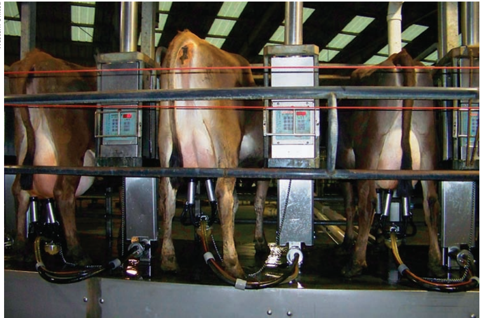
Increasing milk yield per cow and milk nitrogen output are additional strategies for managing nutrients on dairies. Above , Jersey cows are milked twice a day at the Hilarides Dairy in Lindsay, Calif.

Whole-farm nutrient balances provide a general indicator of whether a farm is at risk of building up nutrients and releasing them into the environment.