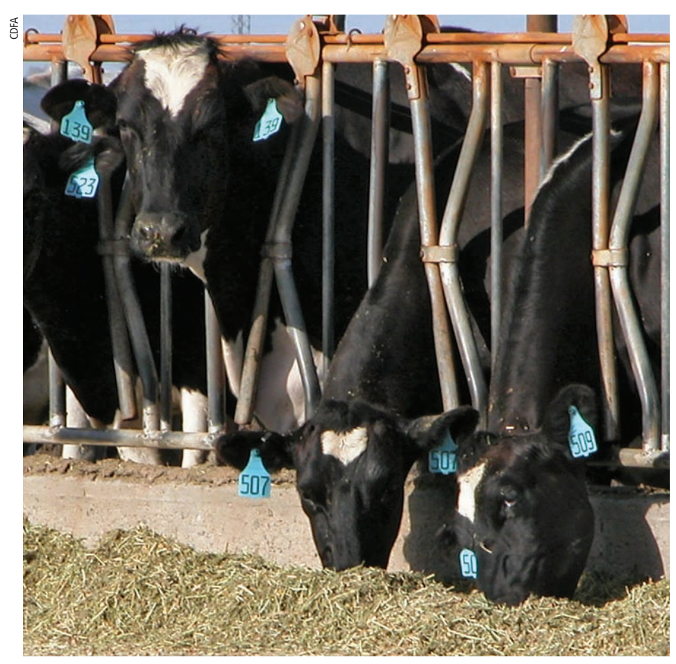
By calculating nutrient balances for the whole dairy operation, operators can improve feed efficiency and protect water quality. More-efficient cropping practices on dairies that grow their own silage and hay, as well as manure management, are important strategies.

In addition to the whole-farm nutrient balance previously discussed, two additional balances can be estimated: (1) when diets are adjusted according to animal requirements and (2) when manure is applied to the soil according to crop requirements (fig. 1). In both cases, nitrogen is one of the most studied nutrients used to estimate whole-farm nutrient balances.