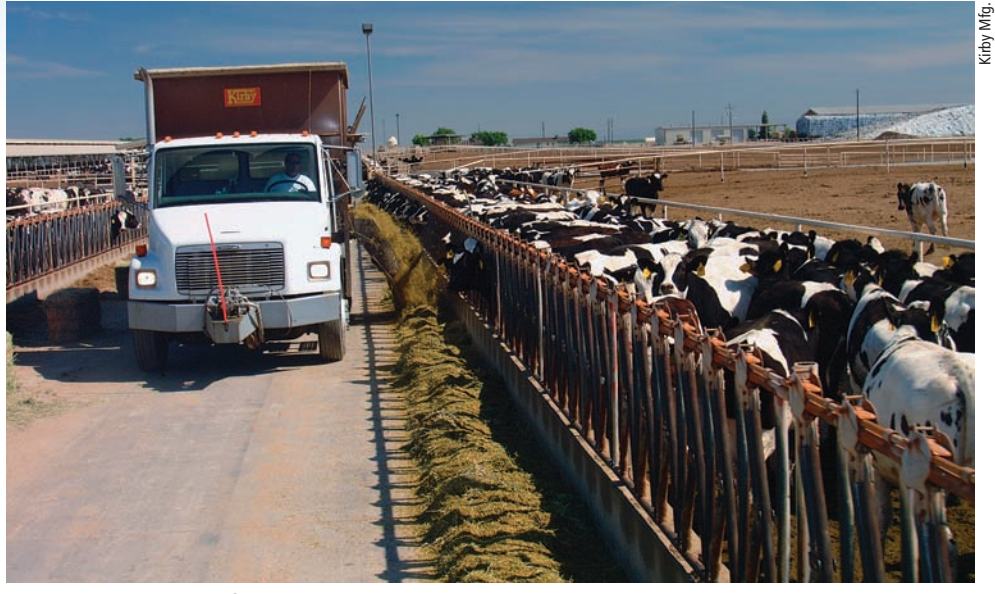
Dairy operations in California are becoming more concentrated, with more cows, more milk produced per cow, and more feed purchased off-farm. In order to limit pollution from nutrient-laden runoff, California dairies in the Central Valley face new water-quality-related rules.

The WMP and NMP will be important objectives for California dairy producers in the coming years. According to the WMP requirements for each dairy, producers must be prepared with sufficient storage capacity to contain all the manure that their dairy produces, to avoid illegal discharges on or off site. They must also be prepared to apply manure according to an NMP based on the chemical composition of their manure and soil, as well as crop requirements.