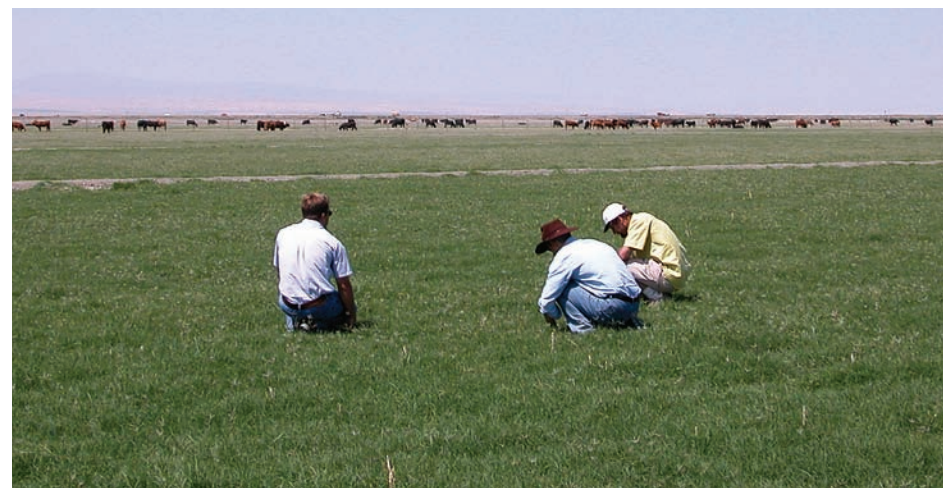
Some biofuel crops may help remediate environmental problems. UC researchers and a grower evaluate bermudagrass pastures in Kings County that were produced on saline soils and irrigated primarily with recycled, saline drainage water.

Standards for energy crops must be based on a clear definition of sustainable agriculture. Hansen (1996) provided a still-useful categorization of differing definitions, arguing for (1) a literal definition of sustainability — the ability to continue over time, (2) the quantitative assessment of properties associated with sustain-