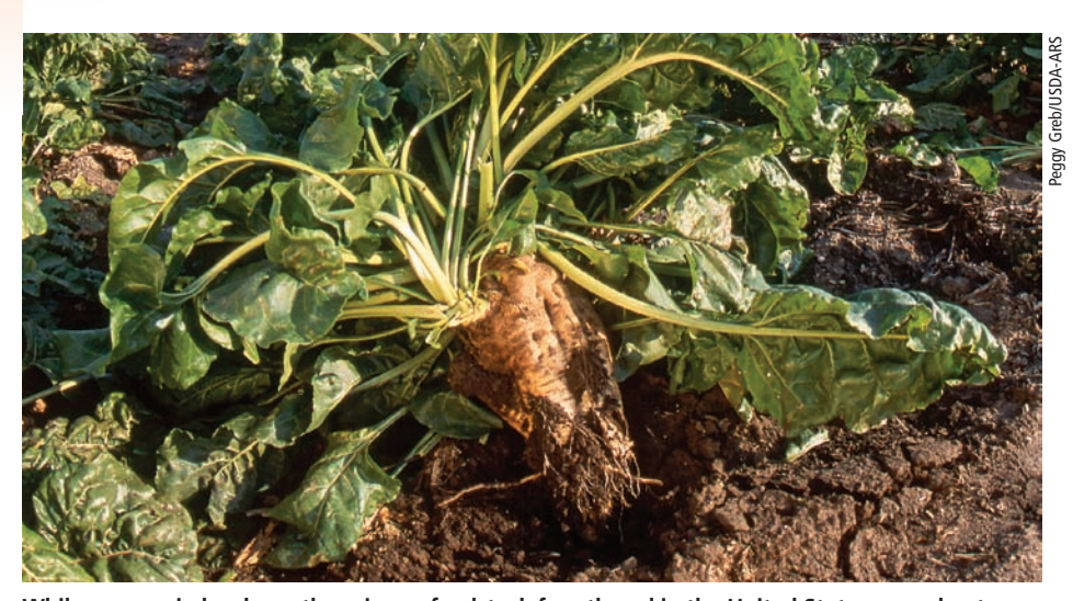
While corn grain has been the primary feedstock for ethanol in the United States, sugarbeets have a higher per-acre ethanol yield, especially given the high root yields achieved in recent years in California.

se of crops for biofuels has developed rapidly in the United States since the U.S. Congress passed federal energy bills emphasizing biomass in 2005 and 2007. The Energy Independence and Security Act (EISA 2007)