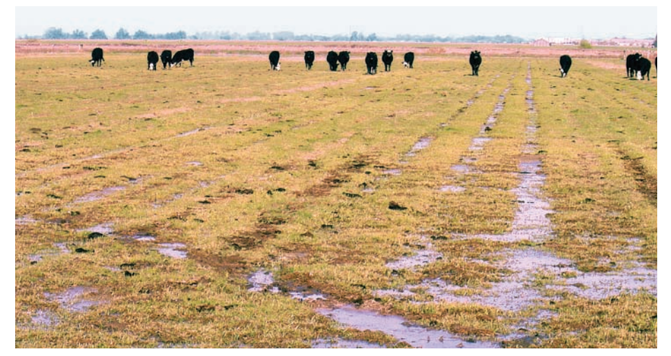
Cattle graze on a bermudagrass pasture grown on saline soils in Kings County; the fast-growing grass could also be harvested as a biomass feedstock if suitable markets were available nearby.

in dry years, potentially limiting production levels in biorefineries using it as a feedstock. In contrast, the production of a salt-tolerant perennial grass in California using moderately saline water for irrigation could provide reliable, predictable supplies of biomass to a factory sited near the point of production. If yields are high, the distance biomass must be moved would be reduced because the area needed to produce it would be smaller and biorefineries could be centrally located.