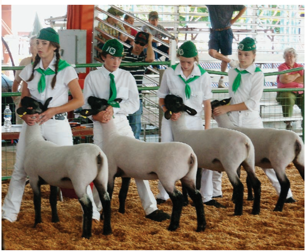
Participants in the Shasta County 4-H program exhibit their project lambs at the Shasta District Fair.

Along with personal data such as age, grade level and years in the 4-H program, the California record book includes a personal development report (PDR) with a quantitative page