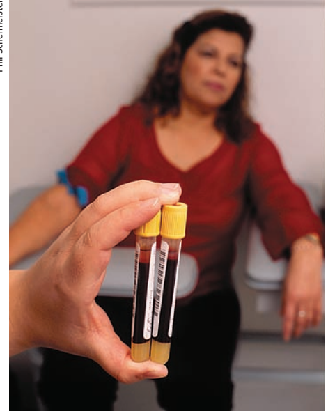
Nutrition therapy, exercise and medication can help to manage type 2 diabetes, and ongoing medical attention is critical.

ing in 10% to 40% of uncontrolled diabetes cases already having developed complications by the time of diagnosis.