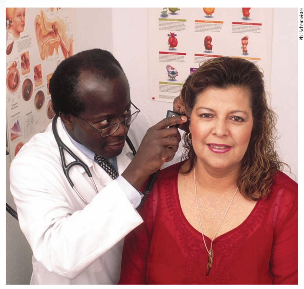
Type 2 diabetes is being diagnosed more frequently in Latinos, in whom serious complications such as amputation are more common than in non-Latino white patients.

T the United States, diabetes af-Fects an estimated 23.6 million people, most of whom do not achieve optimal control of their blood glucose levels (Valitutto 2008). Fueled by the obesity epidemic, this disease is expected to affect 48.3 million people by 2050 (Narayan et al. 2006). Globally, the number of people with diabetes is projected to double over the next 30 years, with much of the increase expected to occur in developing countries (Chaturvedi 2007). We review trends in type 2 diabetes and provide a perspective on the implications for occupational health and safety programs targeting farmworker populations. We also discuss ways that outreach and research programs of the University of California and UC Cooperative Extension can help to reduce the burden of diabetes.