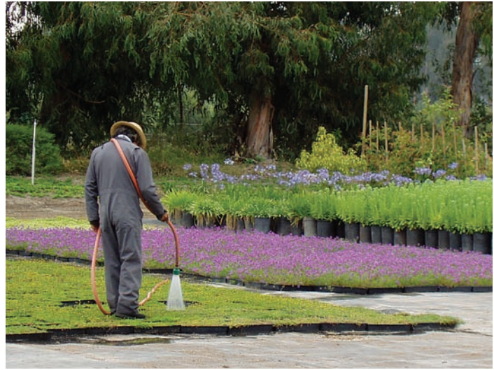
Hand-watering accounted for 18% of the production area in surveyed nurseries. Experienced personnel are necessary to avoid overwatering, and an on/off valve is recommended.

Runoff. The six questions in the runoff management category covered the collection and recycling of irrigation and storm-water runoff. Good management practices were not common, but their adoption increased from the initial survey to the resurvey in 2006. Pooled “yes” responses were only 10% in 2004, but increased significantly to 20% in 2006, with 43% “not applicable” (table 1).