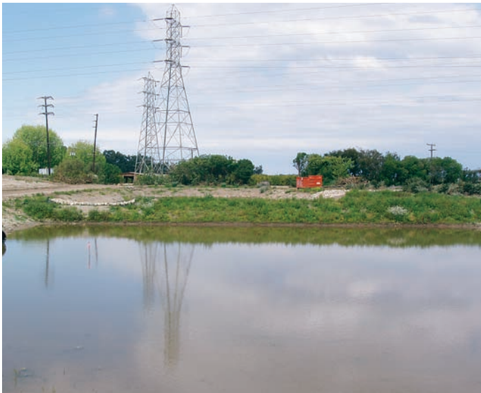
The unlined bottom of this detention basin allows captured runoff to percolate slowly into the ground. Soils and vegetation remove some contaminants from the water as it percolates or is taken up by plants.