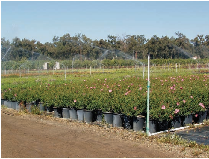
Overhead irrigation was used in 30% of the surveyed production area. If containers are not closely spaced, a significant portion of the applied water falls between containers and is wasted as runoff.