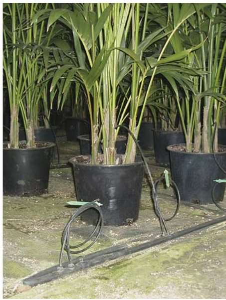
Drip tape, left, and microirrigation stakes, right, are low-volume irrigation methods. In Southern California, 51% of surveyed production areas employed a low-volume irrigation method. When properly scheduled, such methods are effective in preventing runoff.