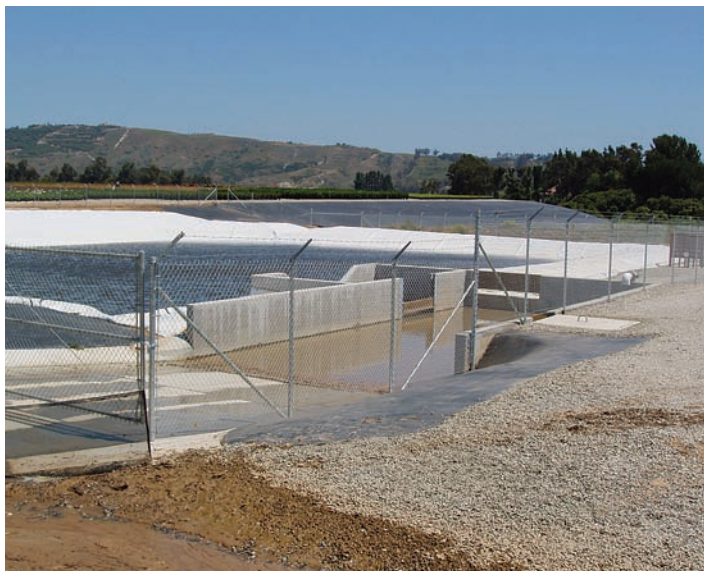
A retention basin allows runoff to be treated and recycled for use as irrigation water. Ventura County nurseries that recycle irrigation runoff significantly increased from 6% in 2004 to 14% in 2006.