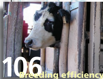
Breeding efficiency 106