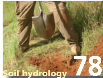
Soil hydrology 78