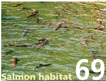
Salmon habitat 69