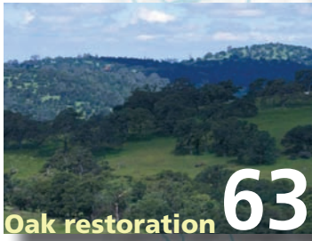
Oak restoration 63