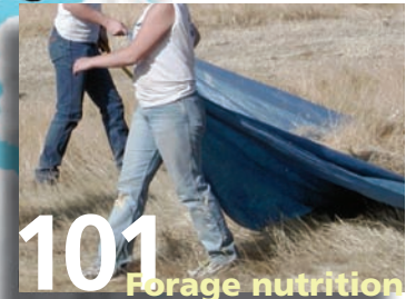
Forage nutrition 101