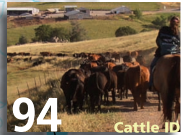
Cattle ID 94