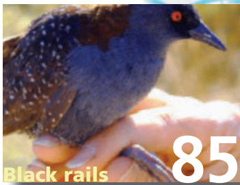
Black rails 85