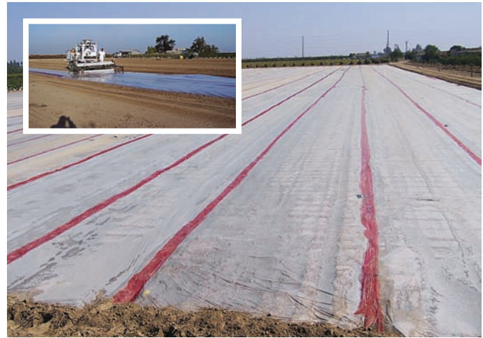
A company applies fumigant through drip irrigation in a strawberry field.