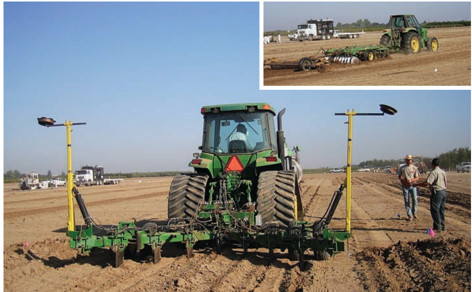
Shank application of 1,3-D is followed by a disking/rolling operation, inset , to break the shank trace and compacted soil surface.

Soil fumigation with methyl bromide has been used for decades in California to control a variety of soil-borne agricultural pests, such as nematodes, diseases and weeds. Major, high-value cash crops that rely on soil fumigation include strawberries; some vegetables such as carrot, pepper and tomato; and nurseries and orchards for stone fruit, ornamentals and grapevines. In California, tree and grapevine field nurseries must meet requirements of the California Department of Food and Agriculture (CDFA) Nursery Nematode