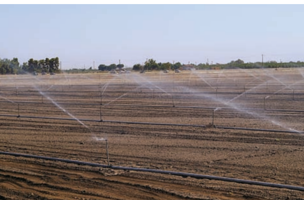
Irrigation with sprinklers forms a water seal, which minimizes emissions after fumigation.

Cost is important when evaluating the feasibility of emission-reduction