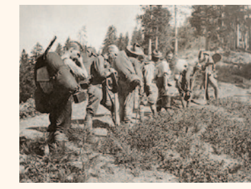
The Fritz-Metcalf Photograph Collection features images such as this one of Professor Metcalf leading a forestry class on a 12-mile walk to Camp Califorest at Feather River, in 1921.

The editorial staff of California Aariculture welcomes your letters, comments and suggestions. Please write to us at: 1301 S. 46th St., Building 478 - MC 3580. Richmond, CA 94804, or calag@ucdavis.edu. Include your full name and address. Letters may be edited for space and clarity.