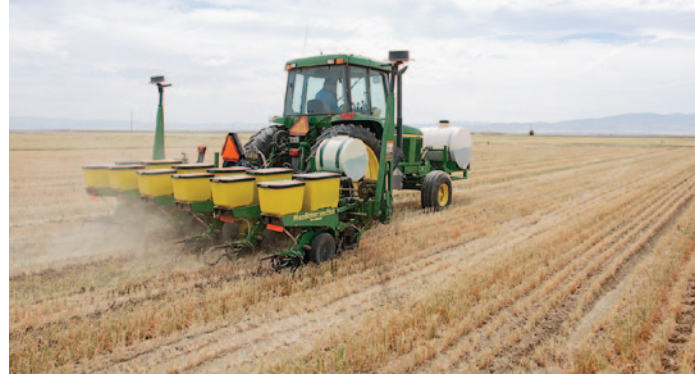
With conservation tillage a crop is seeded directly into wheat stubble, shown in Five Points, 2009.

refinement of conservation tillage systems in California. A wide range of innovative equipment has been introduced to the region, which has functioned successfully under various conditions. Whether conservation tillage has a larger future depends on two critical factors: the need to achieve vigorous crop stands and the need to avoid soil compaction.