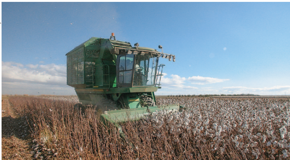
A stripper harvester is used to pick cotton in ultra-narrow rows in Five Points, 2007.

The data that we have collected, as well as our recent experience with conservation tillage cotton in the San Joaquin Valley, and the far wider experience of researchers from the U.S. Cotton Belt (Bradley 1995), have been encouraging enough to warrant further evaluation and