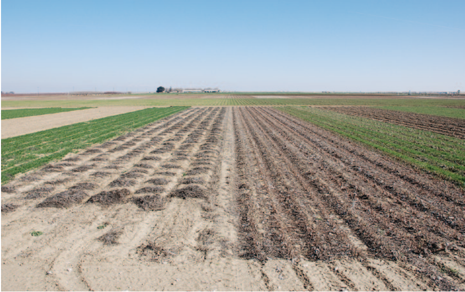
The field layout for the cotton-tomato rotation study shows postharvest tomato beds (left) and conservation tillage cotton beds (right), with and without a cover crop in Five Points, 2007. In later years of the study, cotton lint yields were similar for the conservation tillage and standard systems.