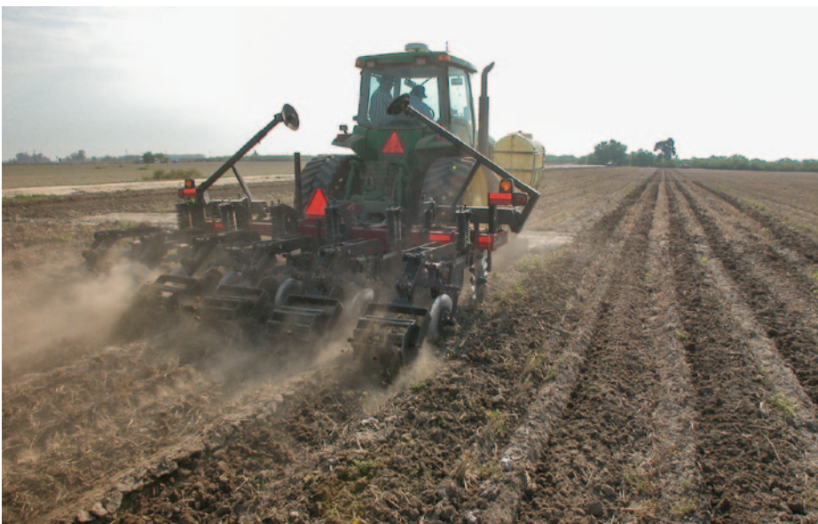
A Case DMI Ecolo-till six-row strip-tiller prepares seedbed strips prior to cotton seeding (in Riverdale, 2003), generating less dust and particulate matter than disking the entire field.

depending on factors such as soil texture, moisture content and aggregation. These affect the extent to which the soil fractures and permits good seedbed conditions following operations.