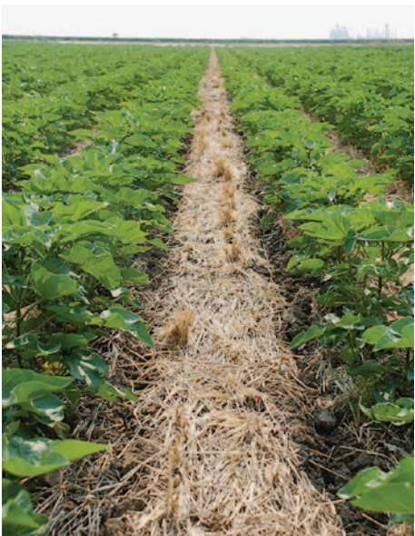
Glyphosate-resistant Acala cotton was grown in a winter triticale, rye and pea cover crop with no tillage in Five Points, 2007.