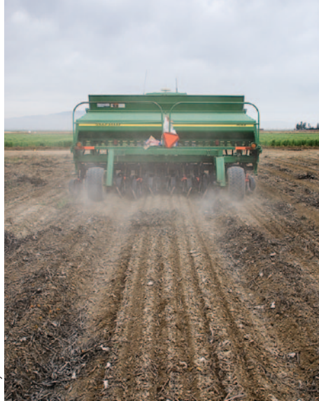
A John Deere 1560 15-foot no-tillage drill is used to seed cotton in ultra-narrow rows at 7.5-inch spacing in Five Points, 2007.

between no-tillage, strip tillage, reduced tillage and conventional tillage systems were not significant. The 5-year average profit for the no-tillage system ranged from $7 to $66 per acre higher than for the other three systems. This work concluded that farmers and crop consultants should consider overall profit rather than just crop yield when evaluating alternative tillage practices.