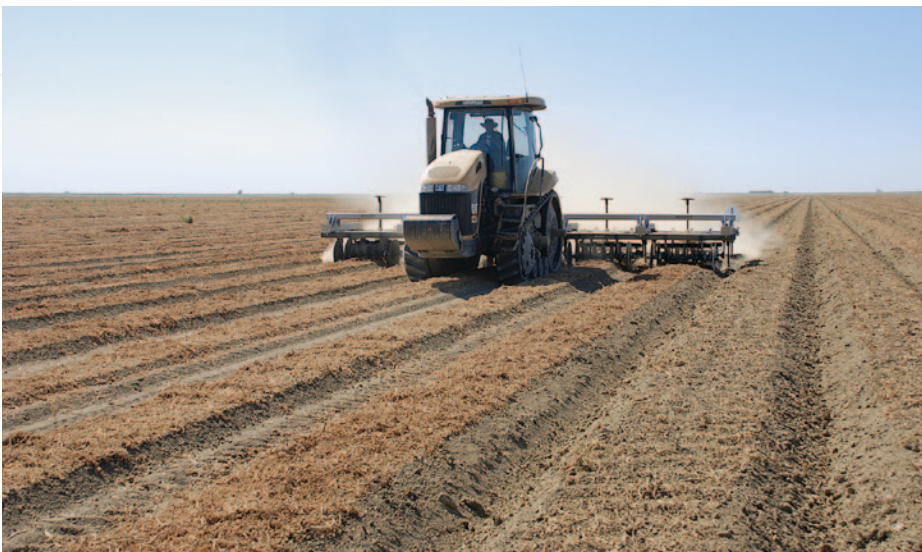
Fewer passes translate into about $70 less per acre spent on fuel, labor and repairs. A Wilcox Performer incorporates tomato postharvest residue before the next crop in Five Points, 2007.