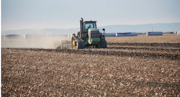
Standard postharvest cotton tillage includes shredding aboveground cotton plants and disking the residues as carried out in Firebaugh, 2007.