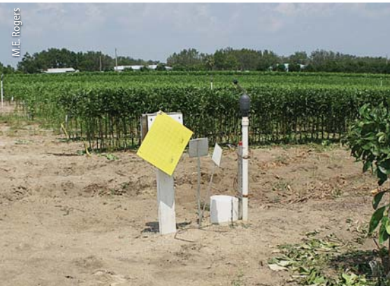
In addition to careful visual monitoring for all stages of Asian citrus psyllid, yellow sticky cards can be used to detect adults.

presence of huanglongbing disease,” Dandekar said. A software program develops an algorithm that lets the machine know it is detecting the disease.