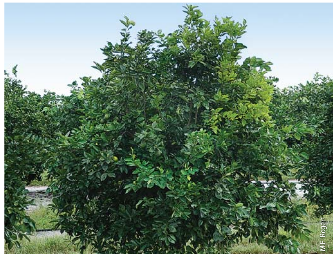
Asian citrus psyllid carries the vector of huanglongbing disease, also known as citrus greening. One symptom of the disease is mottling and chlorosis of leaves.

But that doesn't mean UC researchers and UC Cooperative Extension specialists and advisors are