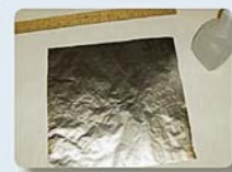
a. Square piece of aluminum foil, approximately 12" x 12" (30.5 cm x 30.5 cm).