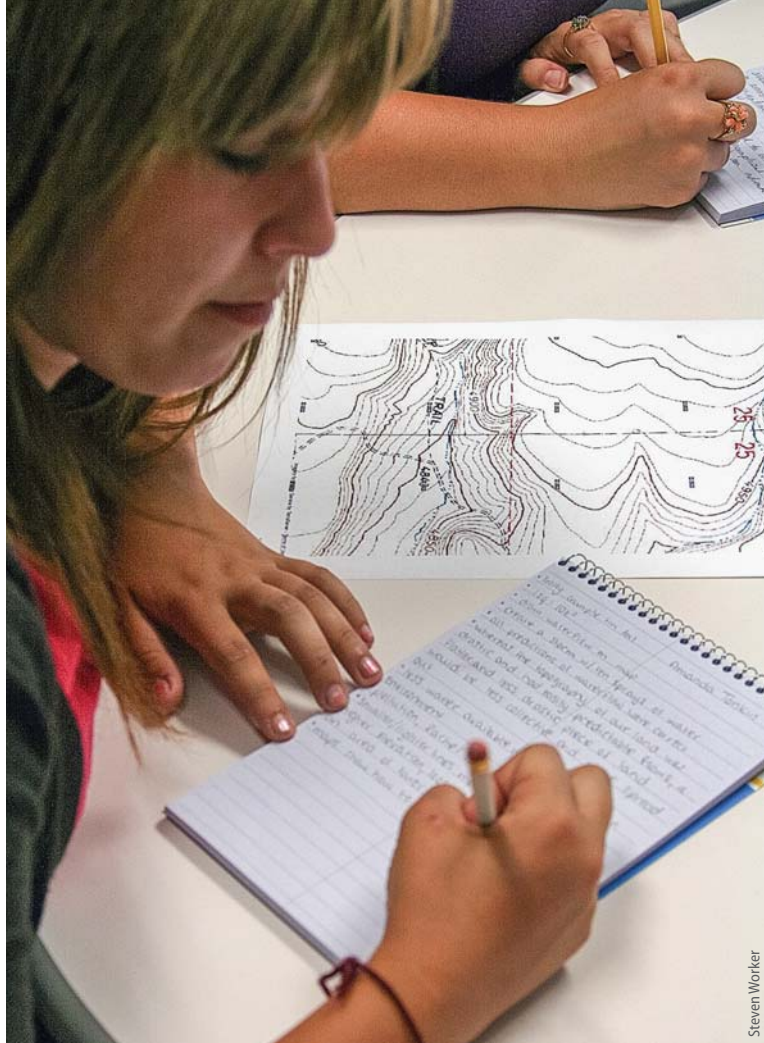
Youth work with topographical maps to learn how the impact of pollutants varies depending on the natural landscape and types of human activities.

of resources, social skills, communication and responsible citizenship, as specified in the Targeting Life Skills Model (Hendricks 1996). Participants rated their levels of knowledge gain using a scale from 1 (not at all) to 4 (a lot). The means