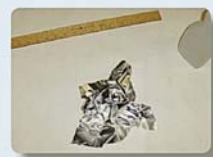
b. Loosely crumple the foil.