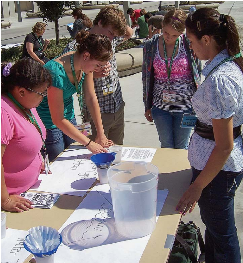
The 4-H curriculum There's No New Water! was developed in response to ANR's Strategic Vision 2025, and it is guided by National 4-H Science literacy goals and strategies. During a workshop at UC Merced, 4-H members simulate the pathways raindrops may traverse through a watershed.

Research has revealed, however, that scientific literacy in the United States is low. Miller (2006) found that only 28% of U.S. adults have a level of scientific understanding necessary to function as citizens in modern society, and scientific literacy among young people is also undesirably low. Nationally, assessments have shown stagnant or declining science scores among school-age youth. The