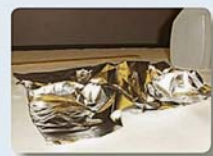
d. The foil should return to its approximate square shape, but have some "peaks and valleys" that represent different land forms.