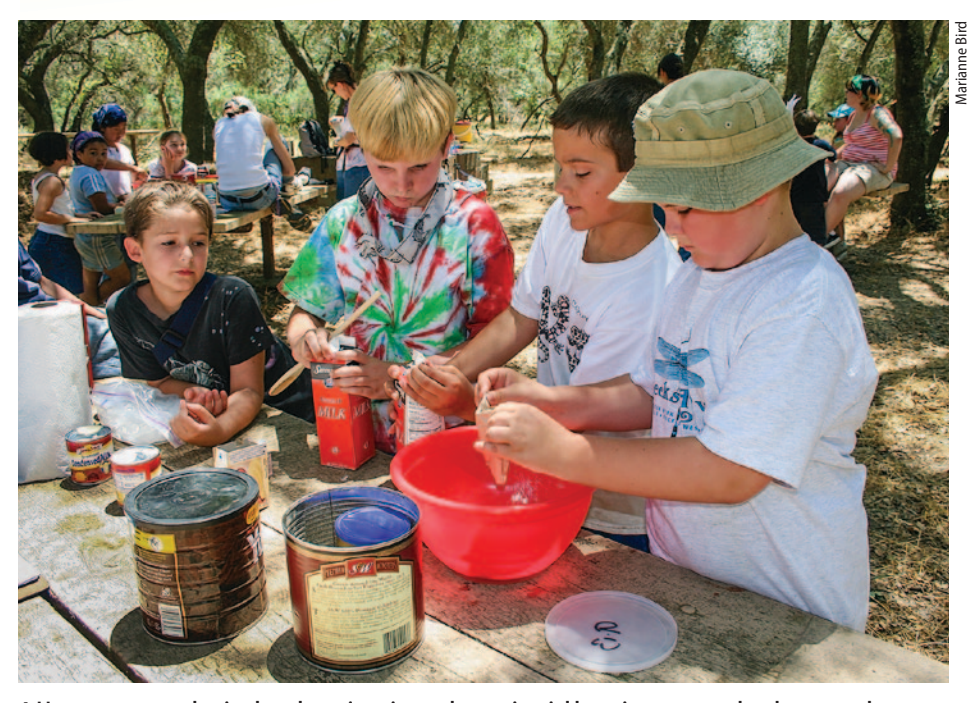
4-H programs emphasize hands-on inquiry and experiential learning, approaches known to be effective in increasing scientific literacy. Kitchen science activities provide opportunities to explore science in everyday life, as shown by these kids at the Sacramento County 4-H Day Camp.

Most aspects of life in twenty-firstcentury society are impacted by science, and many political and economic decisions require that sound choices be made by a population that is scientifically literate (Miller 2006). Citizens of the United States need a fundamental understanding of scientific concepts and theories as well as the capacity to use scientific thinking to address important national and global challenges (Miller 2006). The way to accomplish this is through deliberate education efforts (Lappan 2000).