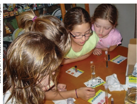
About half of all 4-H curricula are science related. 4-H youth in Orange County test water quality, checking for specific chemicals, turbidity and other factors.

through county, state and national 4-H programs, projects and activities (USDA 2010). Although 4-H continues to provide educational opportunities for youth in the agricultural sciences, the scope of its curriculum offerings has been expanded to include a wide selection of program options in the biological, environmental, engineering and technological sciences. By providing science education programming in more content areas, 4-H is able to reach a broader audience and address the needs and interests of youth from urban and suburban populations, as well as expand curriculum offerings to youth enrolled in after-school programs, summer camps and other shorter-term learning opportunities.