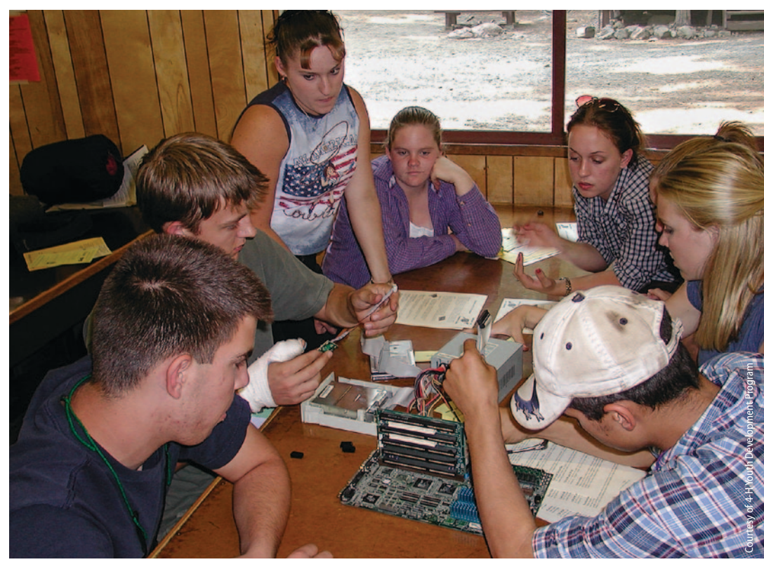
In a California survey of 4-H Youth Development advisors and program representatives (who train adult volunteers), 90% wished to explore the use of models like lesson study and action research as part of their county-based 4-H Science Engineering and Technology (SET) efforts. Shown is a 4-H technology leadership team presenting a workshop on computer hardware.

Volunteers are essential to the 4-H Youth Development Program, serving most commonly as nonformal educators who lead curriculum projects and