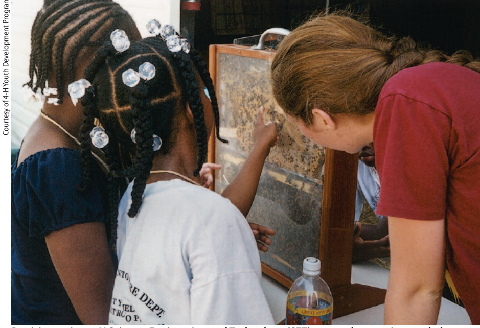
Participants in a 4-H Science, Engineering and Technology (SET) entomology project track the movements of bees in an observation hive. To enhance youths' learning, 4-H volunteers ask openended questions that promote inquiry.