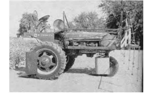
High-clearance cotton picker tractor equipped with wheel shields and sprayer.

The major parts of the sprayer are the pump, pressure regulator, screens and nozzles. Simple gear type pumps which give pressures up to 200 and 300 psi are most commonly used. The pressure regulator is a valve on a spring with an adjustment for obtaining the desired pressure in the line. Screens are needed on the end of the suction hose; in the liquid line between the pressure regulator and boom and in the nozzle body. A felt screen on the suction end of the hose in the spray tank was found to be the most efficient. Wire screens of 100 or 200 mesh, depending upon nozzle size, are used in the other screen positions. Nozzles should be