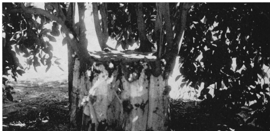
Photograph taken in June 1953 of a seedling orange stump grafted in April 1949, showing the growth of the navel scions.