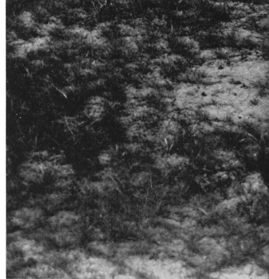
Schismus arabicus invading slick spots. The plants are growing where the soil had cracked the previous summer. Hence the tile-like appearance.

Growth in the test plots started very well and good stands were obtained. However, subsequent rains were light and the plots—along with the native cover on the Westside—dried up in March. The plants did not mature enough to produce seed.