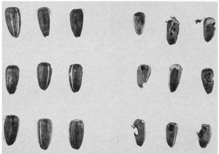
Normal seeds, left; and damaged by sunflower moth, right.

The above progress report is based on Research Project No. 1041.