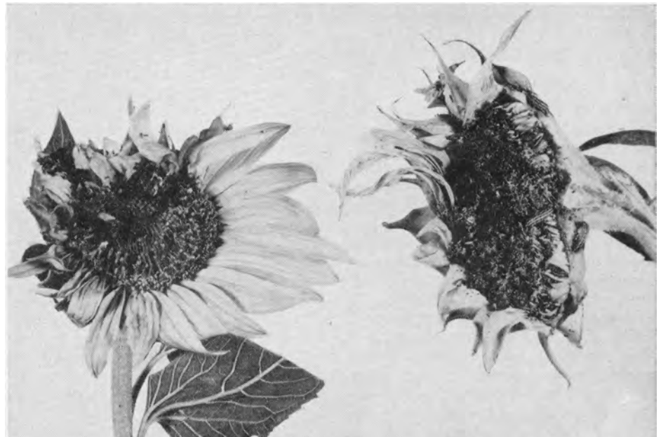
Left, deforming of sunflower head by larvae of sunflower worm; Right, head cut open to show mature larvae and extensive webbing and frass exudation.