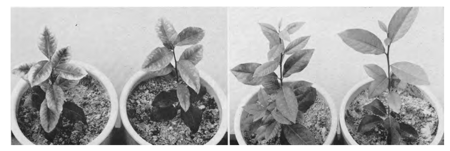
CALIFORNIA AGRICULTURE, JUNE, 1954

The toxic effect of a single application of two liters of Hoagland's nutrient solution containing biuret on the growth of rooted leafy-twig cuttings of Prior Lisbon lemon grown in sand cultures. Left to right: 150, 100, 50, and 0 ppm of biuret.