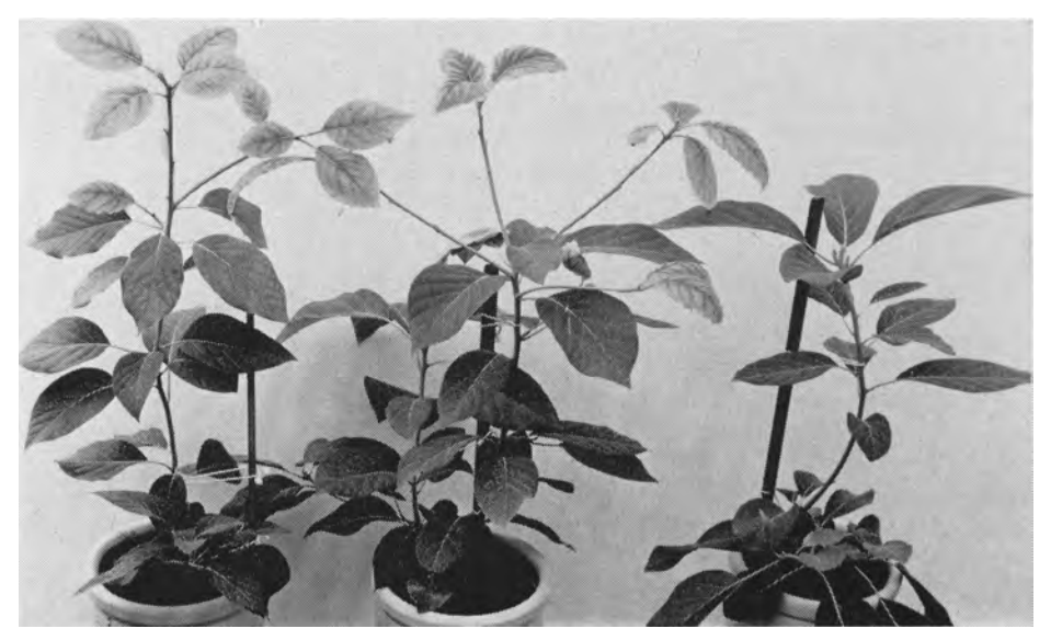
Effect on the leaves of rooted leafy-twig Zutano (Mex.) avocado cuttings grown in soil cultures of a single application of two liters of nutrient solution contain-, ing—Left to right: 100, 50, and 0 ppm of biuret.

On March 4, 1954, each culture received two liters of Hoagland's nutrient solution made with distilled water and containing the trace elements: boron, manganese, zinc, iron, aluminum, copper, and molybdenum. This solution has