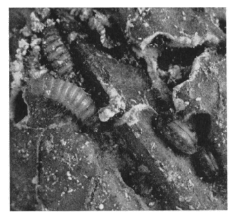
Khapra larvae and adults on pecan meats.

The State of California, by Quarantine Regulation 21, effective January 12, 1955, prohibits the removal from property infested with the Khapra beetle— Trogoderma granarium , Everts—of all materials that might help the spread of this insect which is so destructive to stored grain and grain products.