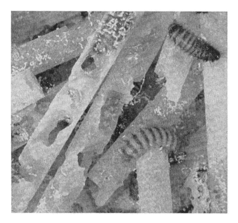
Khapra larvae on spaghetti.

Larvae placed at 90F are continuing to survive after 160 days without food. Other workers have found that the Khapra beetle larvae will survive for as long as three years without food.