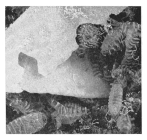
Khapra larvae on egg noodles.

Observations indicate that the Khapra beetle remains active throughout the year in Imperial Valley. Larvae collected at intervals during the winter from infested warehouses, taken to the laboratory, and placed in a 90F temperature cabinet completed their life cycle and became adults in a relatively short time. This would indicate that