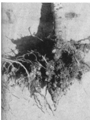
Infested with the clubroot organism. Left: resistant generation. Right: susceptible clublike malformations.

when various lines of sprouts and related crops of the cabbage species — Brassica oleracea — were tested for resistance in heavily infested soil at Half Moon Bay. One of the lines of cabbage tested completely remained free of the disease throughout the season despite severe damage to adjacent plant-