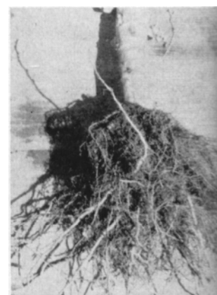
Roots of plants grown on soil in Left: resistant plant of the bad Brussels sprouts; not

Work on the breeding of resistant Brussels sprouts was initiated in 1952,