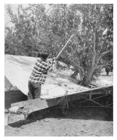
A catching froms in operation.

side. In some cases this action may be repeated before the fruit drops gently into the trough.