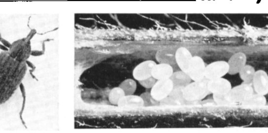
Adult Egyptian al falfa weevil.

The weevil has spread rapidly since 1949 over much of southern California —except in the Mojave desert and the Blythe area of Riverside County—although it was discovered in 1939 in