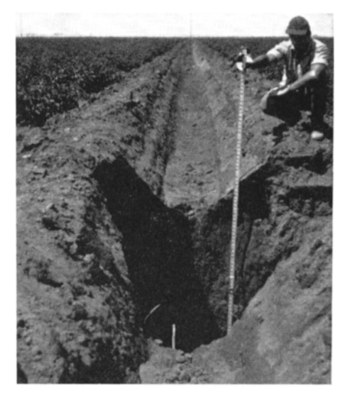
A sinkhole that opened suddenly to a depth of 8'.

crop is an essential link in the chain of circumstances that produces sinkholes in California irrigated fields. Total avoidance of such cropping might therefore mean freedom from the sinkhole trouble.