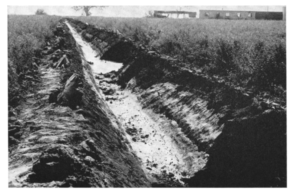
CALIFORNIA AGRICULTURE, NOVEMBER, 1955