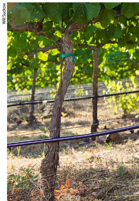
Malbec vines at Trinitas Cellars vineyard in Napa.

Some soils in Napa County and parts of the North Coast of California are derived from serpentine parent material, leading to high Mg concentrations (in relationship to Ca), which can affect plant nutrition and reduce plant growth. A review of research studies indicates that plant growth reductions may occur in some plants when the concentration of Mg in soil solution substantially exceeds the Ca concentration (Grattan