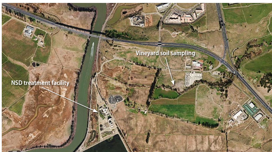
UCANR Statewide IGIS Program

For recycled water to be a benefit to grape growers, it needs to be suitable for vineyard irrigation and there must be no problems with it (such as high salinity or toxic constituents) that could affect the vines or soil; and growers must be confident about its quality and the effects. In 2004–2005, NSD gave UC a grant requesting a feasibility study. For this study, samples of NSD recycled water were collected