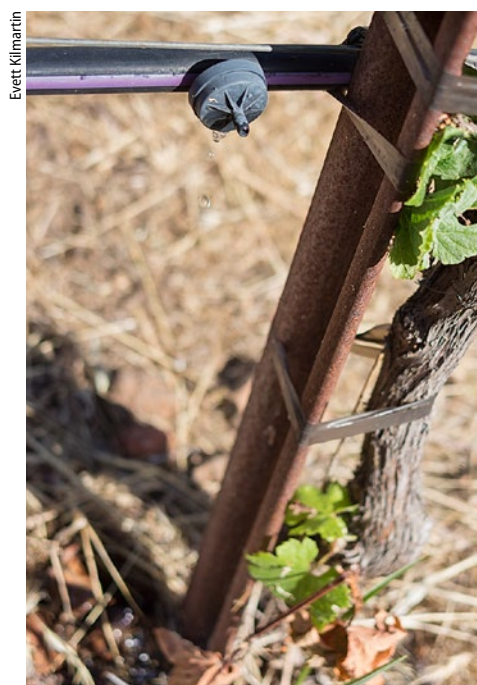
Drip irrigation emitter using recycled water from the Napa Sanitation District.

In addition to the water sampling described above, we collected soil samples in September 2005 from a vineyard that had been drip-irrigated with NSD recycled water for eight seasons (1997 to 2005). Soil samples were collected Sept. 15, 2005, at two depths. The grower typically