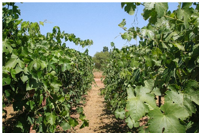
Vines that receive fertilizer applications balanced with their needs, left , show no excess vigor. Vines given too much N produce too much vegetation, right , which can lead to reduced yield and lowered wine quality. The N content of recycled water must be taken into account to keep vines in balance.

and processes of vines, and also of fermentative microorganisms, which can influence quality components in the grape and thus the wine (Bell and Henschke 2008).