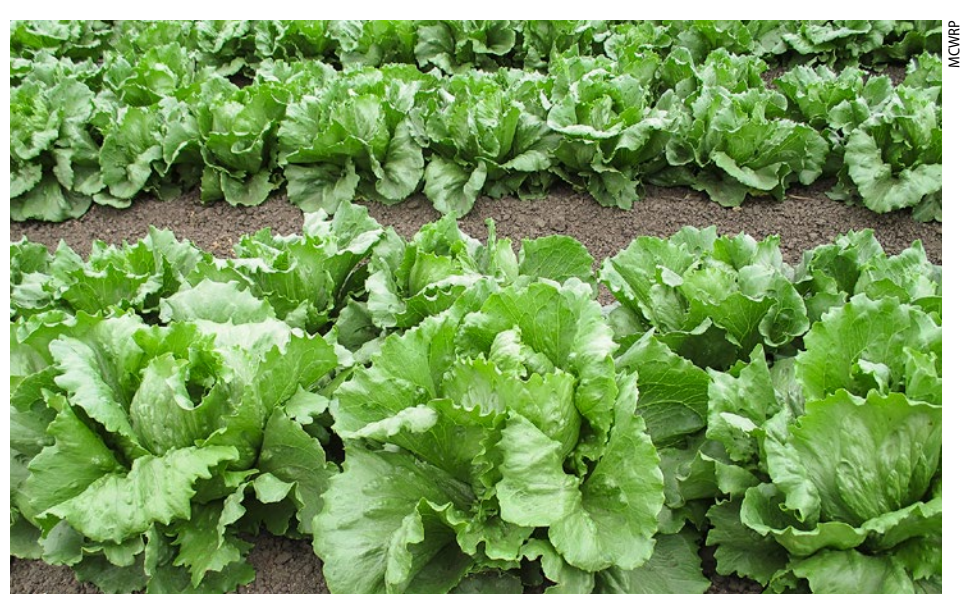
In a study of Salinas Valley fields irrigated with recycled wastewater, researchers found that rainfall leaching is an important factor in maintaining satisfactory root zone salinity levels for salt-sensitive crops such as lettuce and strawberries.

Using recycled wastewater for agriculture and landscaping has environmental benefits because it limits the wastewater discharge into natural waterways while helping to preserve the supply of potable water for human consumption. Recycled water (tertiary-treated wastewater) has been used by a majority of growers in the Monterey County Water Recycling Projects (MCWRP)