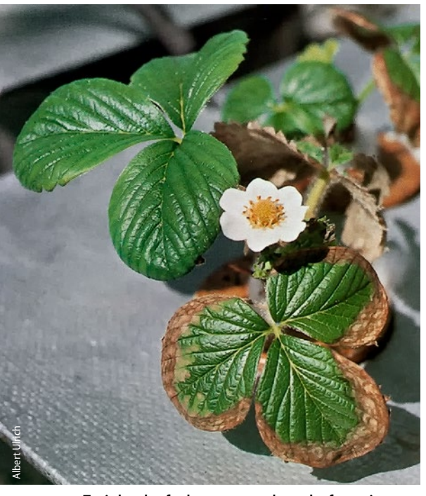
Toxic levels of salt cause strawberry leaf margins to turn brown and dry.

Despite the range in crops grown across the control and test sites, the average annual applied water depths ranged only from 22 to 26 inches, with an average of about 24 inches (60 centimeters) for all years, the same for the eight sites as a whole and the control site (table 2). Similarly, applied water deep percolation during the irrigation season ranged from about 15 to 18 inches, with the average amount at the test sites a little over an