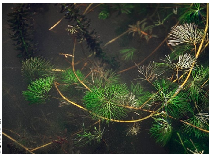
Fanwort ( Cabomba caroliniana ) is an invasive aquatic weed in California that was introduced through the aquarium industry.