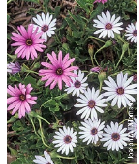
Species introduced as ornamentals or forage species that have escaped cultivation in California include, left, Mexican daisy ( Erigeron karvinskianus ), Japanese honeysuckle ( Lonicera japonica ), buffelgrass ( Pennisetum ciliare ) and African daisy ( Osteospermum ecklonis ). While these species are not yet major problems in the state, some have become more serious invasive plants in other regions of the country.

full prescreening risk assessment before introduction to the state. Plants that are not naturalized in California but that are sold here (table 2) should be reviewed by the nursery industry to reduce their sale and also watched for any spread into wildlands. In addition, noninvasive ornamentals that serve the same purpose in a landscape (same plant shape, same color flowers, etc.) should be promoted as alternative options. Species that are naturalized but not yet sold in California (table 3) should be restricted from sale, and land managers should watch for their further spread. Finally, species that are both naturalized and also sold in California (table 4) may be considered for removal from the