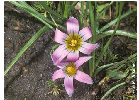
Rosy sandcrocus ( Romulea rosea ), a fairly new invasive species along the central coast of California, was introduced as a garden ornamental.