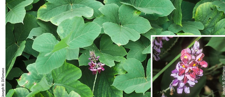
After being introduced as an animal forage species, kudzu ( Pueraria montana ) escaped to invade forested areas in the southern United States. Kudzu is neither naturalized nor sold in California.

a major agricultural sector in California, accounting for $2.5 billion in sales in 2011 (CDFA 2012).