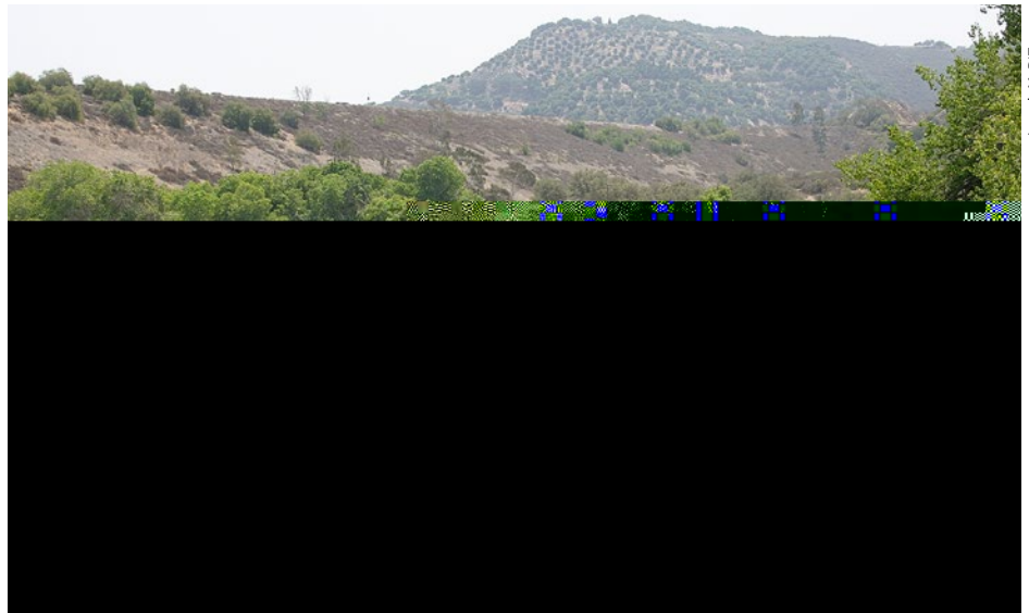
Joseph M. DiTomaso

Plants have been transported around the world for centuries, as agricultural commodities, ornamental species or inadvertent contaminants of imported materials. Naturalized plants are those that have spread out of cultivated areas, including gardens, into more wild areas, and invasive plants are the subset of naturalized species that cause ecological or economic harm. In general, only a small proportion of plants introduced into a new region have been invasive plants. However, the number of invasive plants with horticultural origin is high, making it critically important to natural resource managers, ecologists and policymakers to predict which newly introduced species pose the greatest risk of escape and invasion.