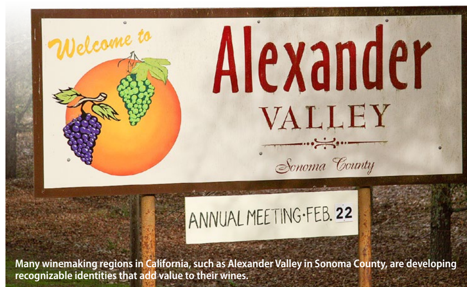
Many winemaking regions in California, such as Alexander Valley in Sonoma County, are developing recognizable identities that add value to their wines.

Winemaking in the Paso Robles region dates back to 1797, when Franciscan missionaries planted the Mission grape, but its long history of winemaking wasn't sufficient to earn it a regional identity for quality wines. Not until the 1970s did a group of winemakers and grape growers in Paso Robles begin the process of creating the identity for which it is known today. Growers in the Paso Robles area were selling their grapes into other regions for blending into top-tier wines and were confident the region could produce its own high-quality wines — and