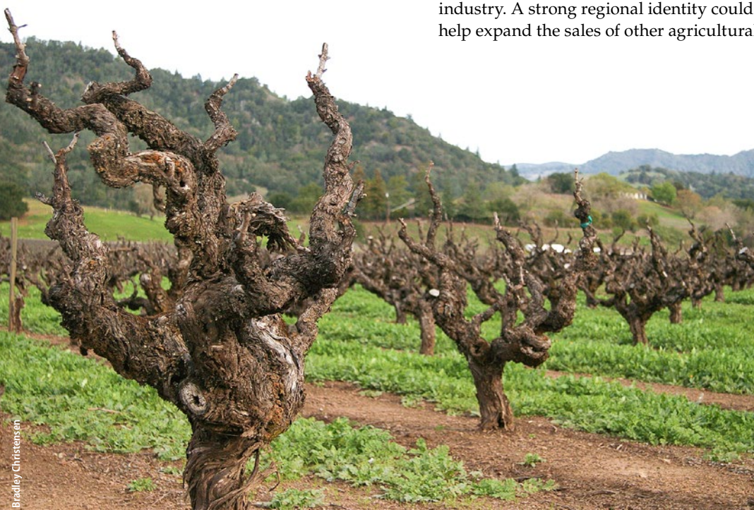
An Alexander Valley vineyard near Healdsburg in Sonoma County.

Organic products. Often mentioned is the possibility of developing regional identity on the basis of organic production, but most regions produce a large