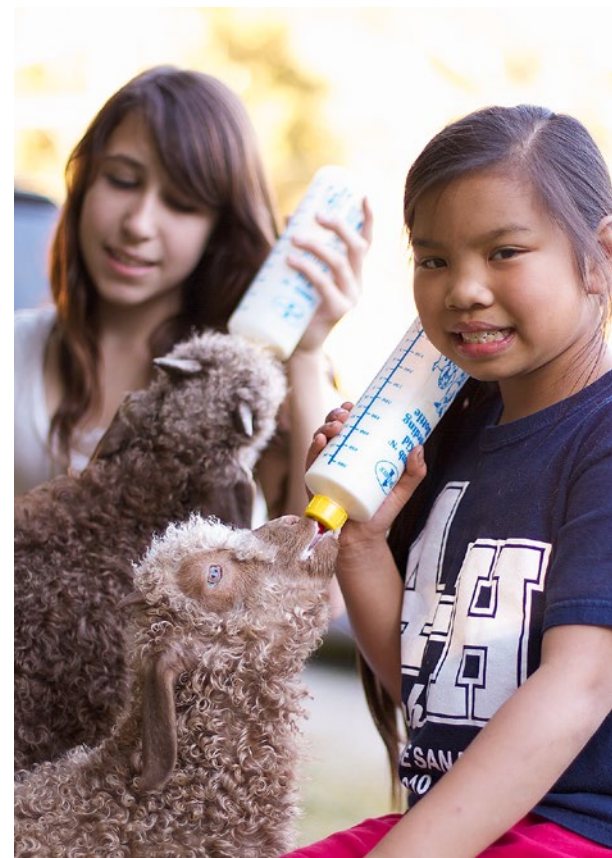
Enhancing interest in science is essential to advancing scientific literacy among youth. Right , San Mateo County 4-H members feeding goats.

Professional development. The knowledge and skills of science educators have a demonstrated positive effect on learner outcomes; therefore, professional development to build educators' capacity is