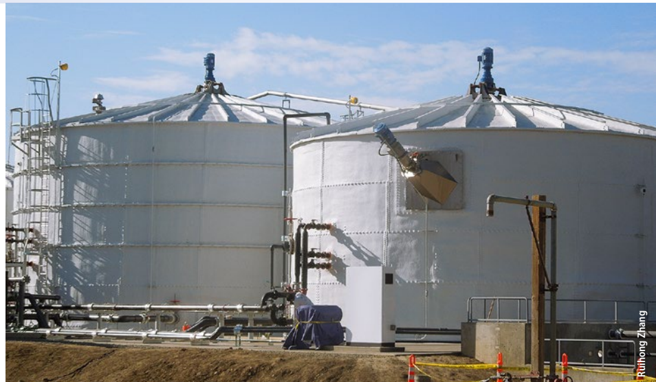
On the UC Davis campus, anaerobic digesters break down food waste and manure and generate biogas.