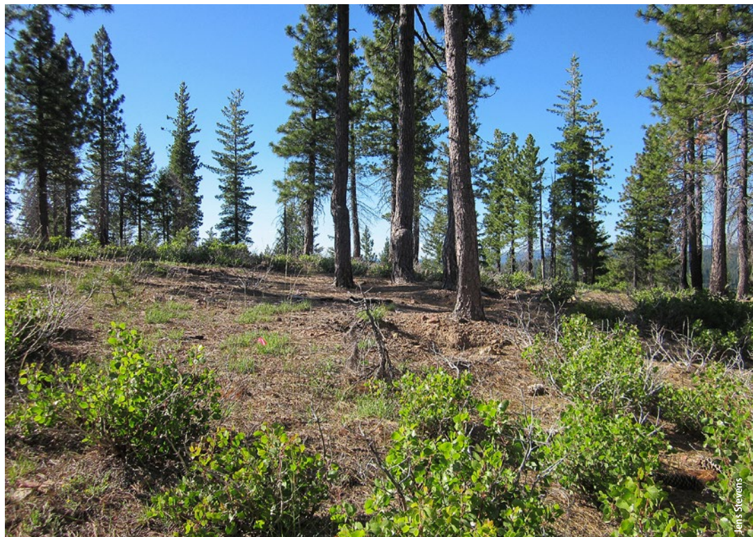
These 2011 photographs illustrate the effect of a fuels treatment implemented prior to the 2008 American River Complex fire in Placer County. Nearly all the trees in the treated stand, bottom, survived the fire, while many trees in the denser, untreated stand, top, did not.