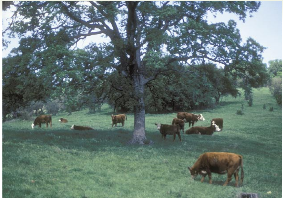
Most oak woodlands in California are privately owned and used primarily for grazing; however, livestock grazing is an important factor in the state's documented low rates of oak regeneration.

Describing the foothill oak woodlands in the Carmel Valley, White (1966) stated that "a prevailing characteristic . . . is the lack of reproduction . . . with very few seedlings." A survey of 15 blue oak