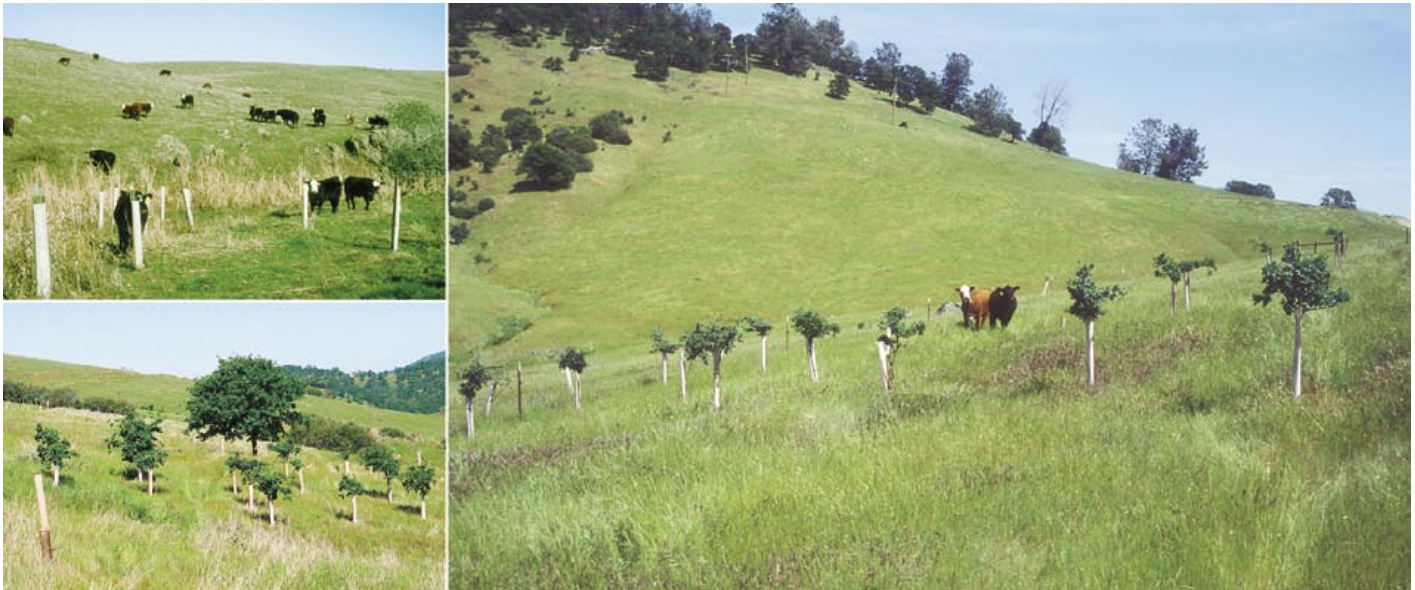
Tree shelters have proved effective in preventing cattle from trampling and grazing on oak seedlings. By the time oaks reach about 6.5 feet, they are generally able to withstand cattle damage in little- to moderately grazed pastures.

low-cost procedures for restoring oaks. Several of these studies have been conducted in areas grazed by cattle, with the objective of identifying how oaks can be established in grazed pastures without removing these lands from livestock production. The question of how cattle and oaks can be raised together is important because more than 80% of California oak woodlands are privately owned (Ewing et al. 1988), with much of this land in livestock production.