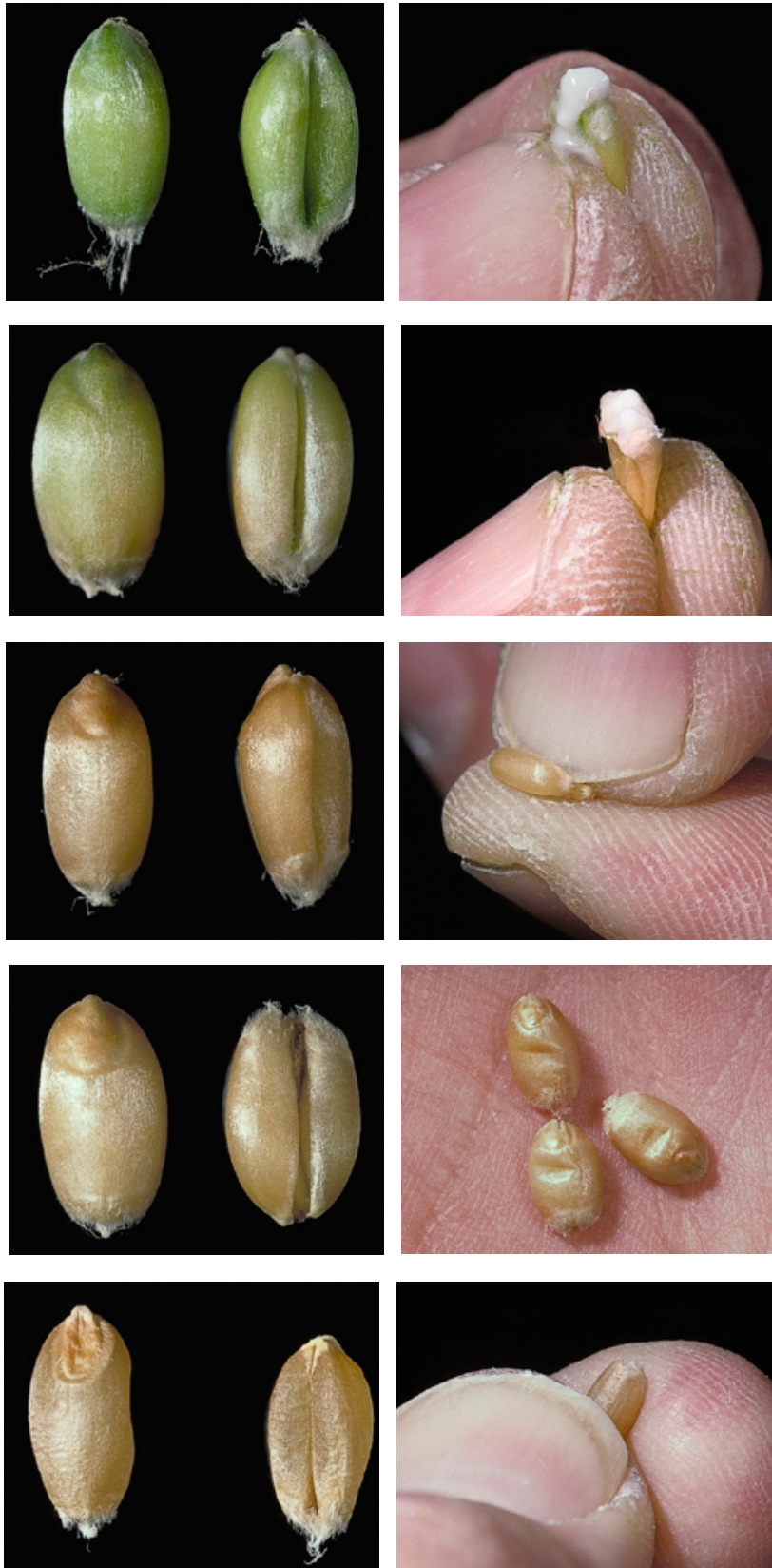
Figure 2. Stages of grain ripening in wheat.

spikelet consists of three to six potentially fertile florets. In the highly branched panicle of oat, individual spikelets form at the end of branches.