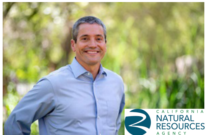
Wade Crowfoot, California's Natural Resources Secretary

Lake Tahoe is the largest alpine lake in North America and trails only the Great Lakes in volume. The Sierra Nevada mountains are known for their mixture of forests, meadows, brush fields, riparian areas, rock outcrops and other natural resources. This land is home to many species of sensitive plants along with animals popular to wildlife viewers such as bald eagles.