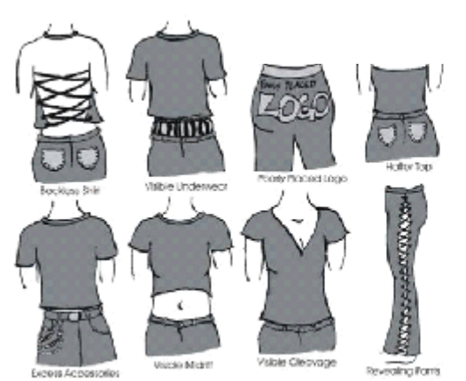
Dress Code Violations