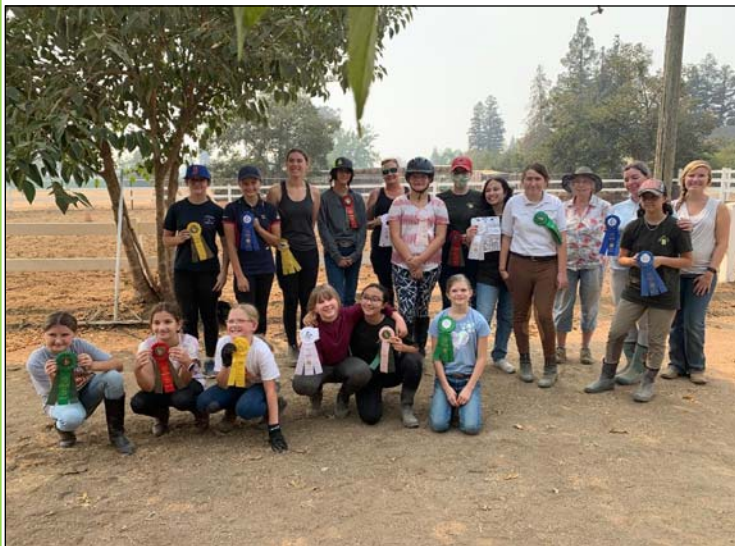
“Spy vs. Spy” County Horse Rally participants

I hope to see a lot of other 4-H members at the horse show at Academy Equestrian Station on November 13th! Non-horse spectators are always welcome to cheer on your favorite rider too!