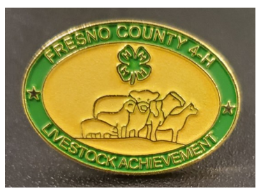
Custom Medals awarded to top scoring participants.

Program covers species of beef, dairy goats, meat goats, sheep, and swine. Project leaders please utilize the resources and assist project members in preparing for and attending Livestock Achievement Day 2024.