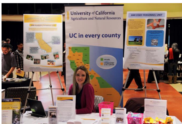
A good place to find out about ANR opportunities!