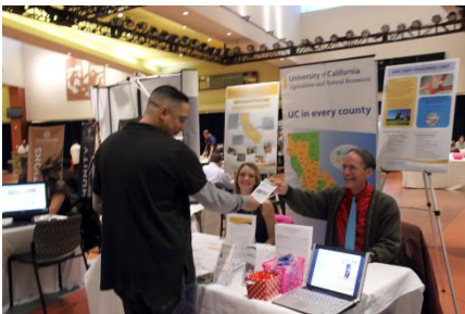
A student finds out about careers at ANR.