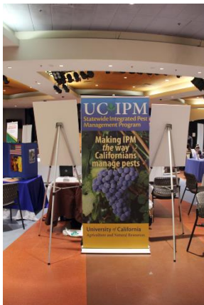
The back of the ANR table at the job fair.

The slide show "We are UC ANR" was played on a laptop at each end of the table and prompted many people to stop by. (And the baskets of free candy also helped bring folks over!) There were students from a nearby community college who stopped to chat and learn about the opportunities available at ANR.