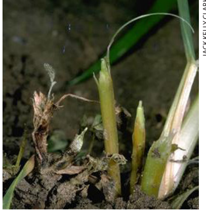
Gopher damage to wheat