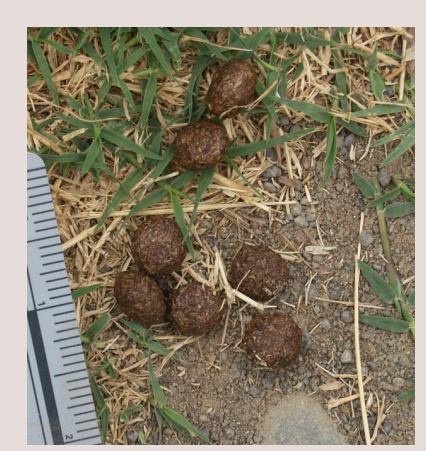
Blacktailed jackrabbit droppings