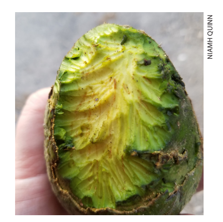
Ground squirrel damage to avocado