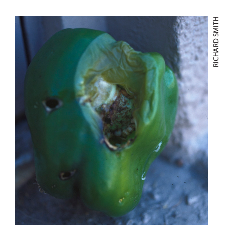
Bird damage to pepper