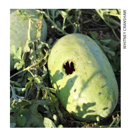
Raccoon damage to watermelon