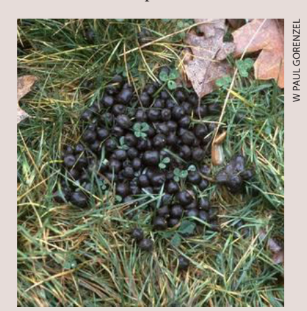
Mule deer droppings

Animal droppings, or scat, can help identify the animal present and even determine what it's eating. This sign can vary greatly and should be only part of the diagnosis.