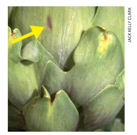
Vole damage to artichoke