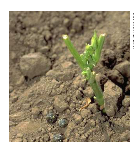
Jackrabbit damage to bean