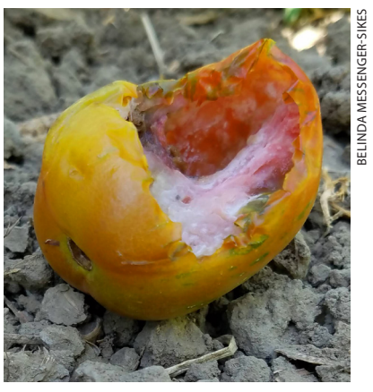
Rat damage to tomato