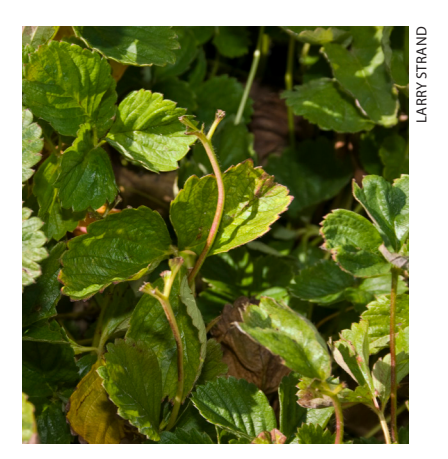
Deer damage to strawberries

Damage to fruit, leaves, and whole plants by an animal will help identify the pest since the mouth and teeth of each animal species differ. Other signs are needed to confirm the identification.