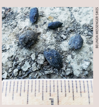
Ground squirrel droppings