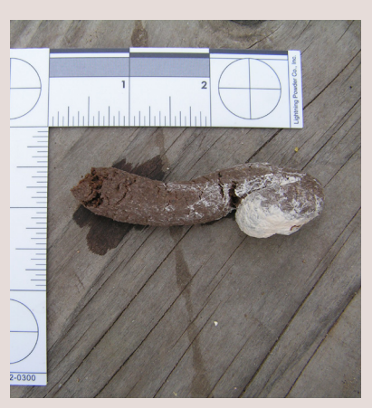
Wild turkey droppings